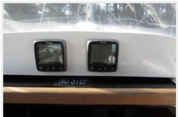
Instruments above companionway