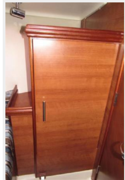
Forward cabin storage