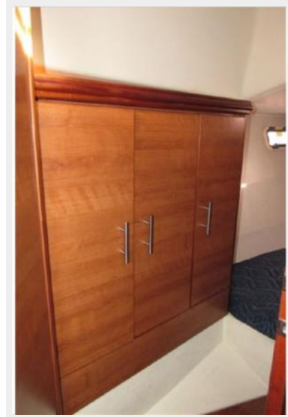
Aft cabin storage