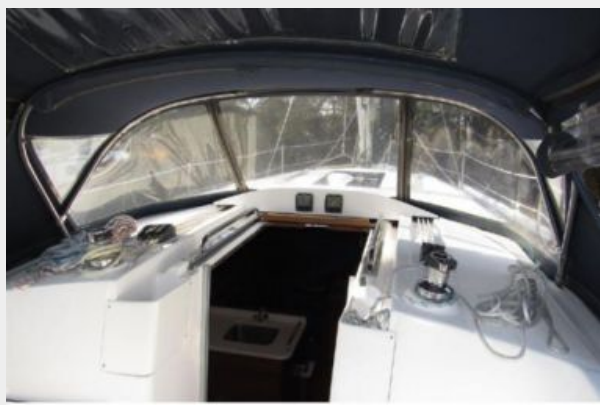
Dodger, halyard winches and companionway