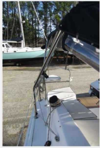
Starboard coaming and arch