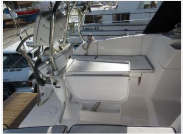
Cockpit with transom down