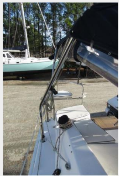
Starboard coaming and arch