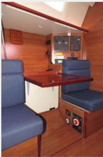
Starboard settee converted to seats and table