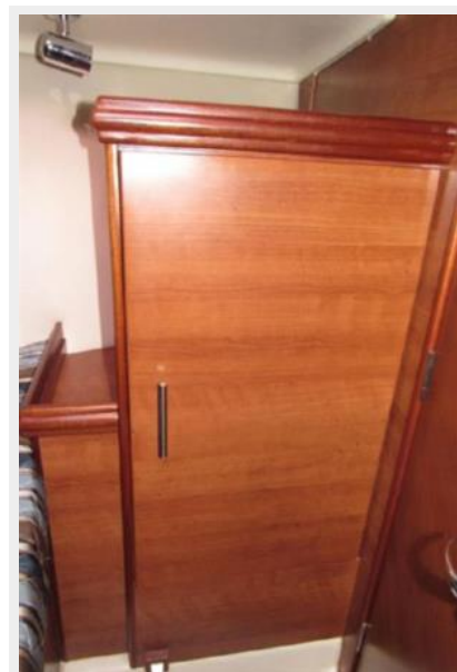
Forward cabin storage