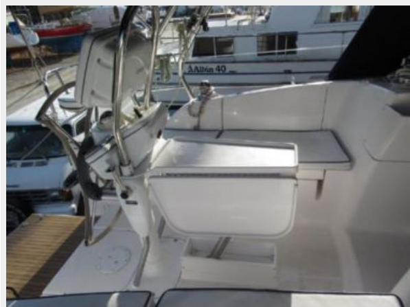
Cockpit with transom down