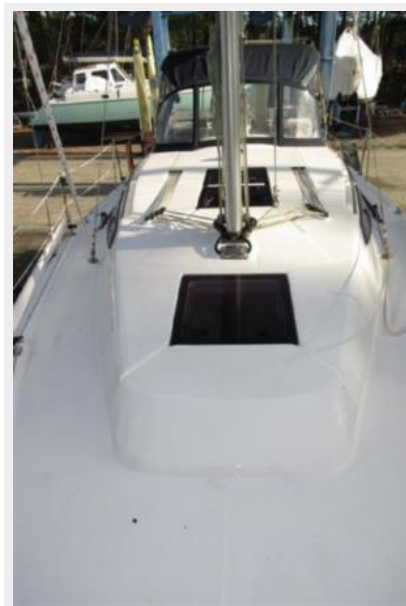
Deck from bow