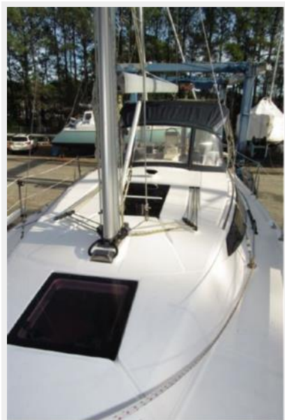
Deck looking aft