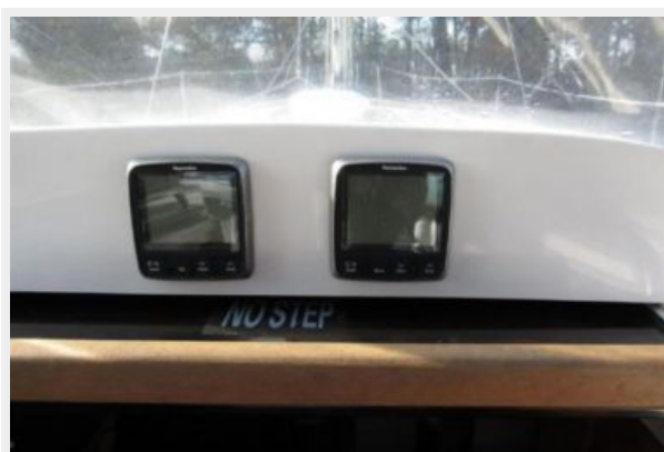
Instruments above companionway