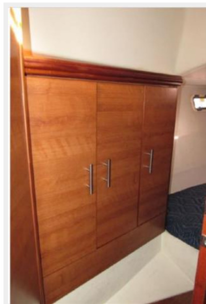
Aft cabin storage