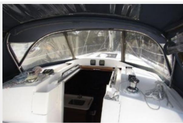
Dodger, halyard winches and companionway