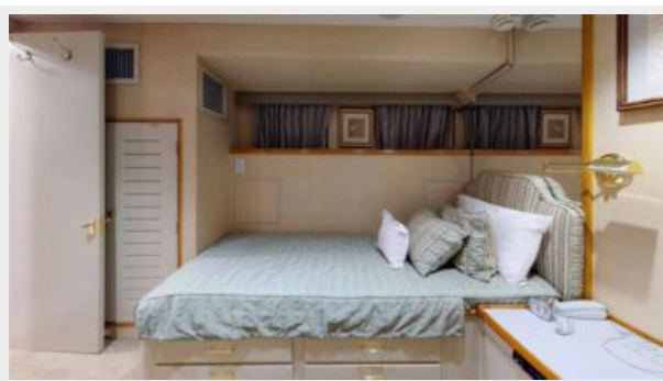
Outboard of Twin Berths