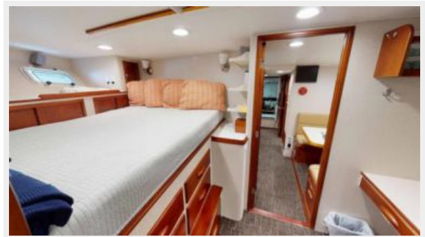
Capt Cabin Looking Aft