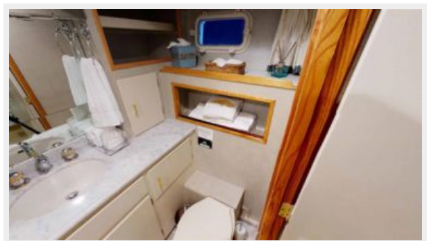
Twin Bed Head