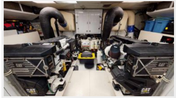
Engine Room Looking Aft