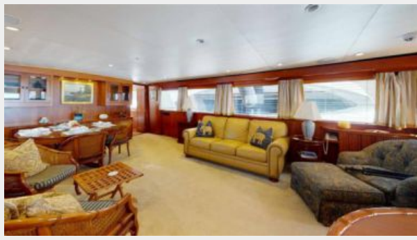
Salon Looking to Starboard