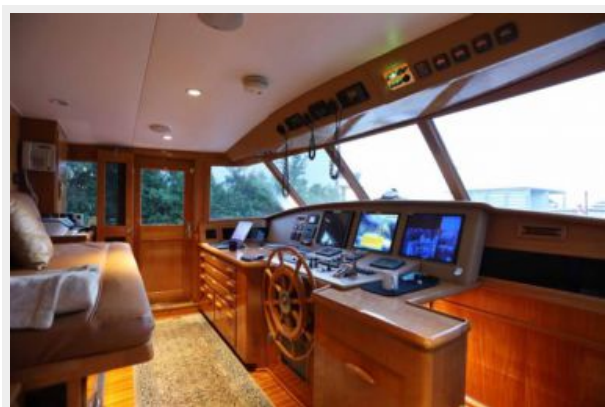
Helm Looking Port