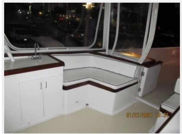
FB After Corner Seat