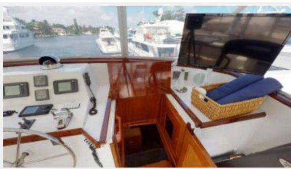
FB PH Stairs