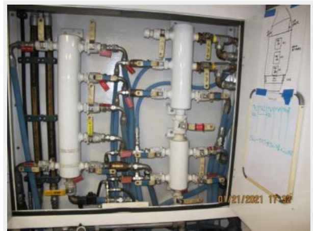
Fuel Manifold Cabinet