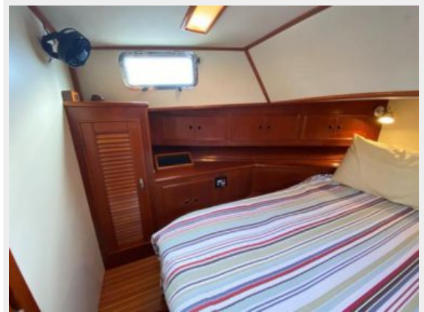
Master Stateroom Looking Port