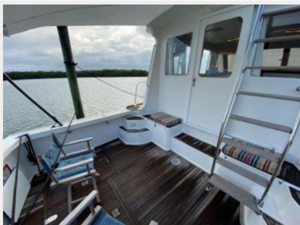
Cockpit Looking Port