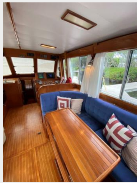
Salon Looking Starboard