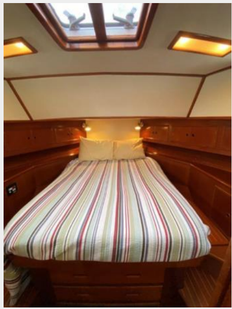
Master Stateroom Looking Forward