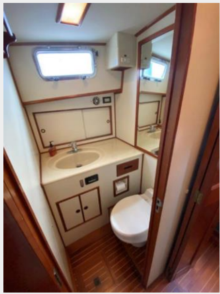
30) Guest Head 2 (002)