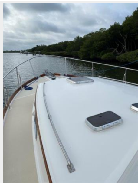
Bow Looking Forward