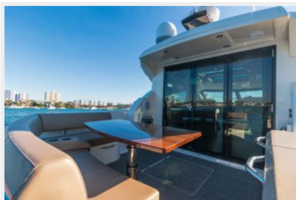
Aft deck - Forward facing