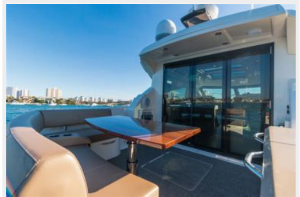
Aft deck - Forward facing