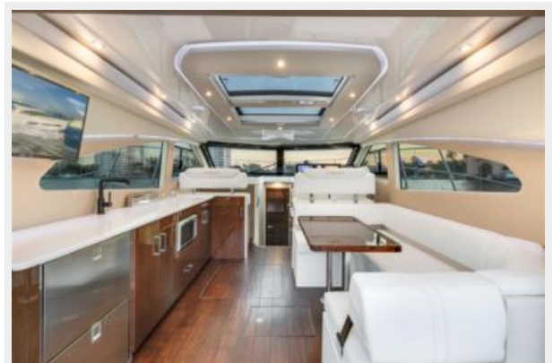
Salon - forward facing (twilight)