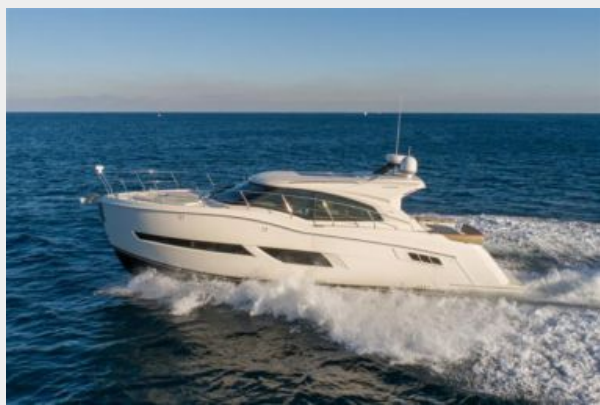
Running - Port profile