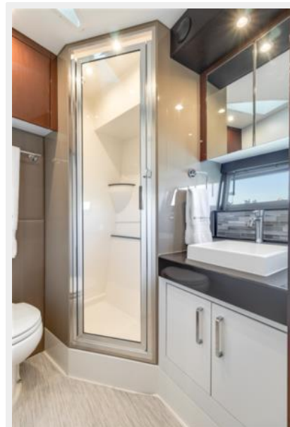
Master - Ensuite shower stall