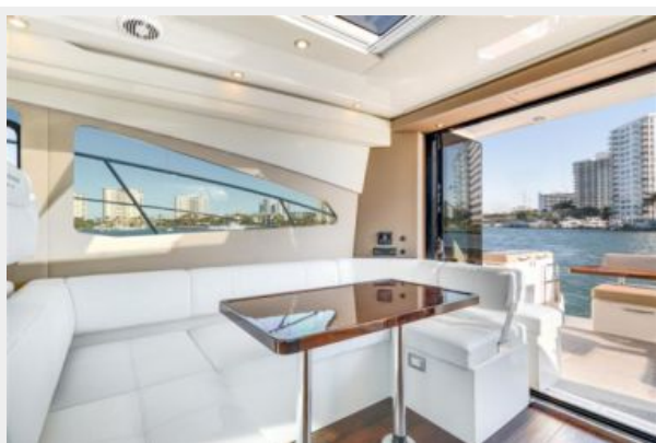
Salon - Sofa