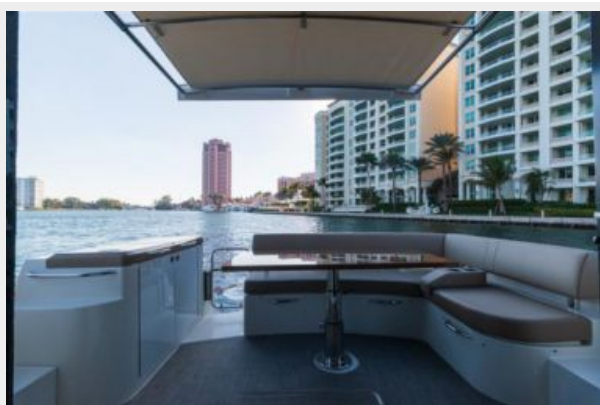
Aft deck - sunshade