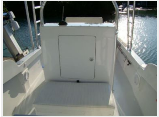
6. Forward Console Seat