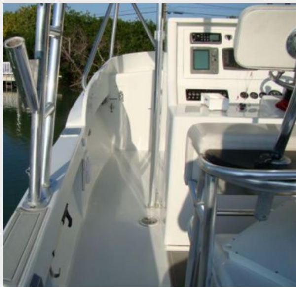
7. Port Gunwale