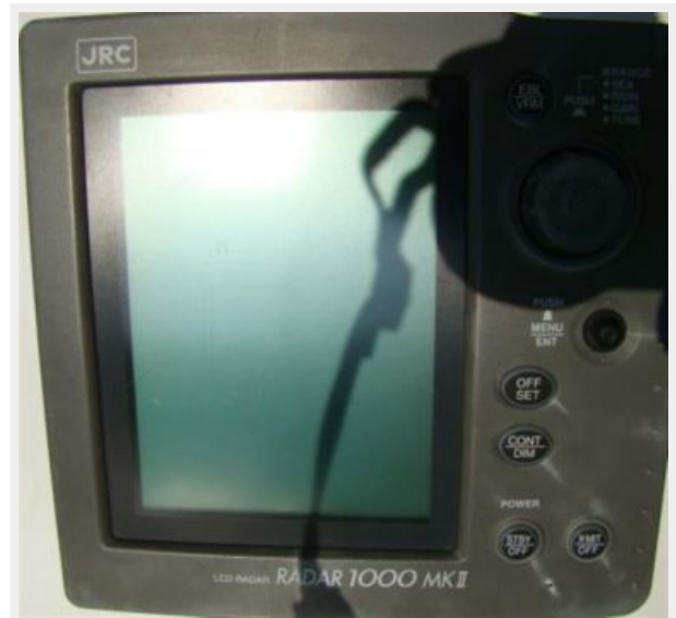
18. JRC Radar