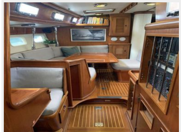
Passageway Fwd. to Salon