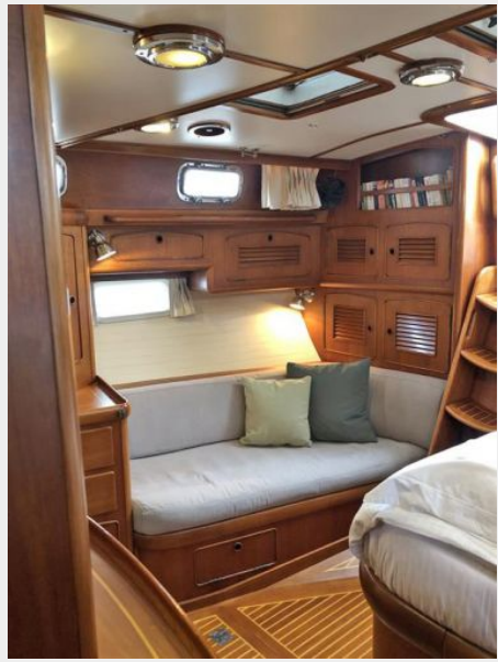
Owner's Stateroom Settee, Stbd.