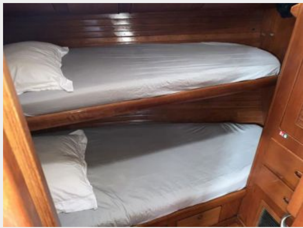
Port Guest Berths