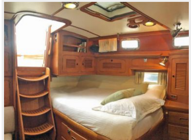
Companionway to Private Aft Cockpit