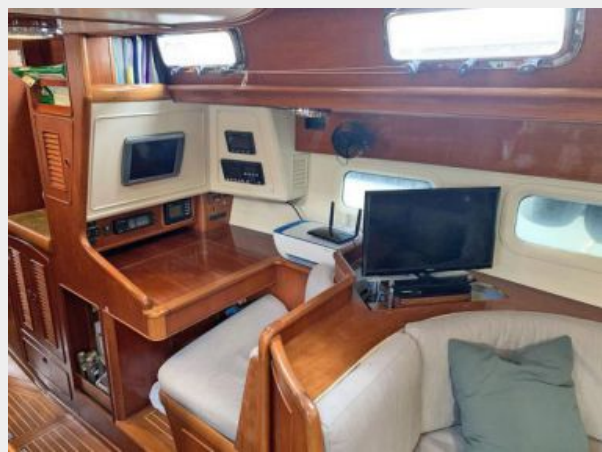
Nav Area, Port Side