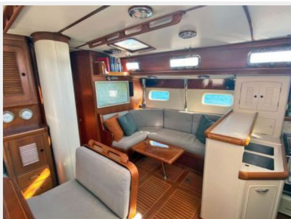
Salon to Stbd.