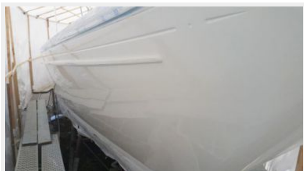
New Awlgrip Hull