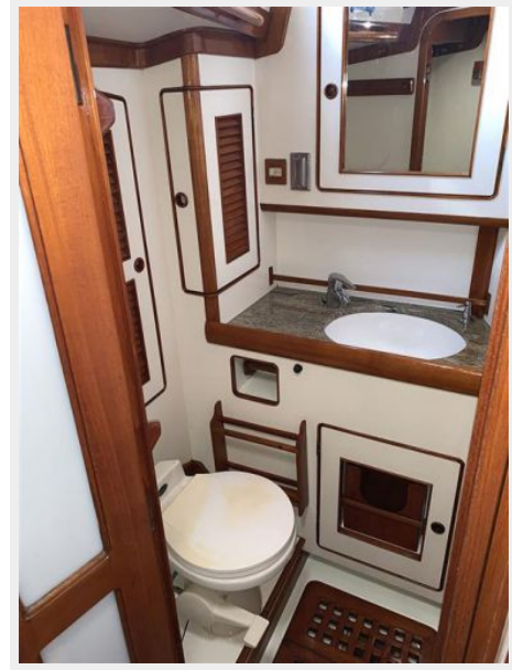
Guest Head, Vanity