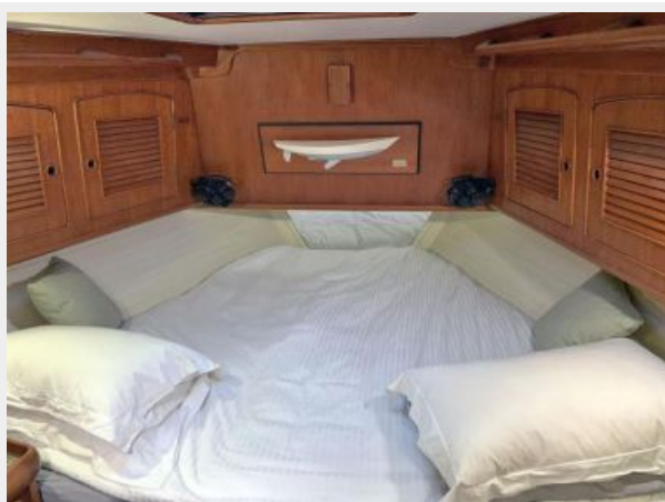
Fwd. Guest Stateroom Berth