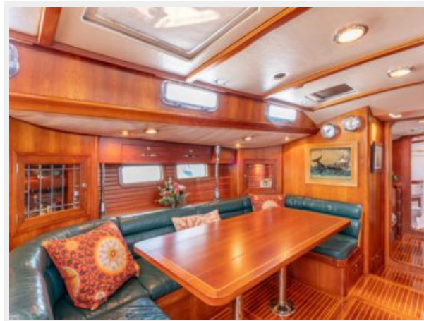
Main Saloon, Port