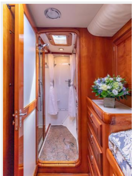
Fwd. Guest Shower