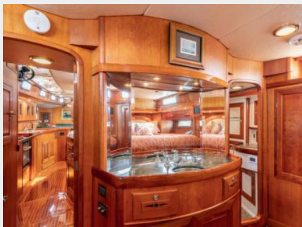
Owner's Cabin Fwd.