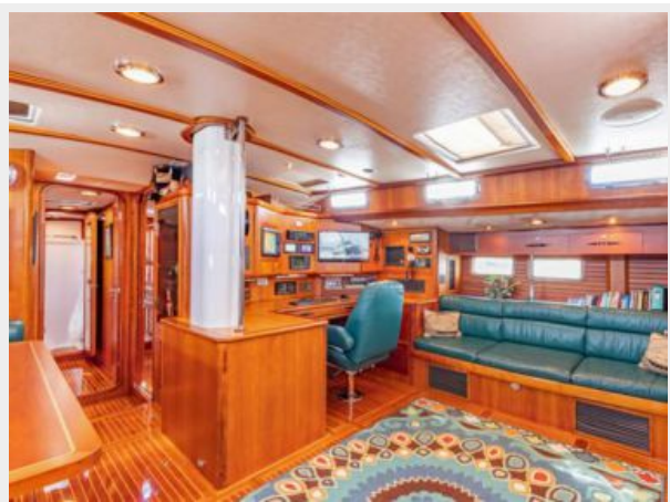
Main Saloon, Stbd.