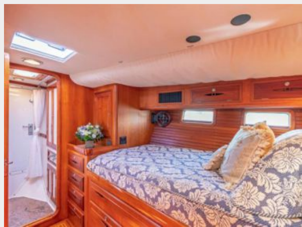
Stbd. Guest Cabin, Looking Fwd.