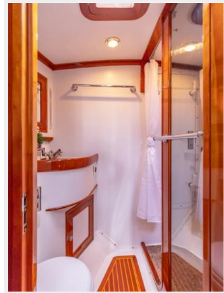
Fwd. Guest Head