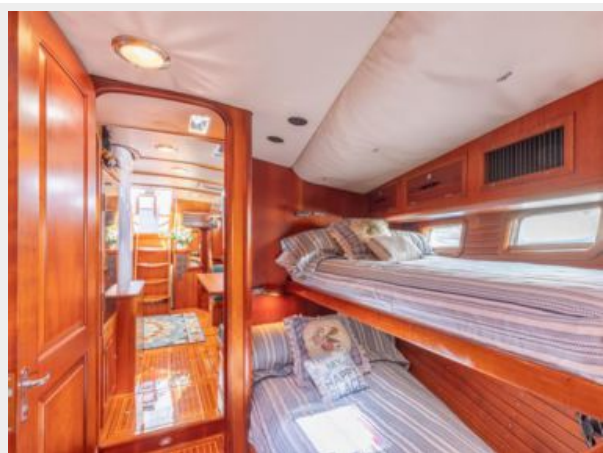
Port Guest Cabin