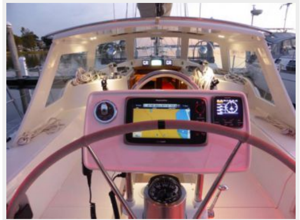
Hard dodger viewed from helm