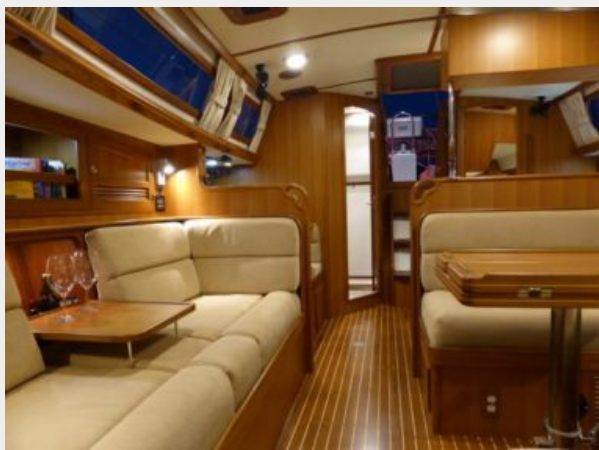
Salon looking aft with cocktail table down