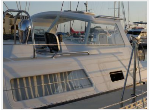
Handholds on hard dodger