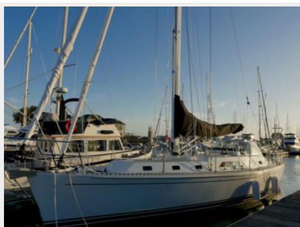
At the dock