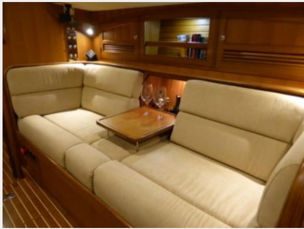
Cocktail table down on starboard settee