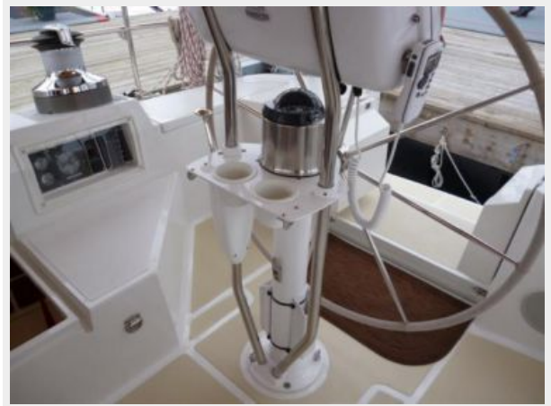
Helm and engine controls