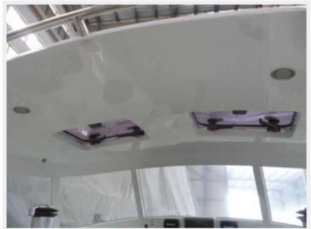
Hatches and LED lights on hard dodger