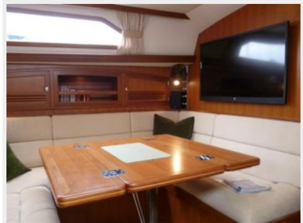
Salon table open