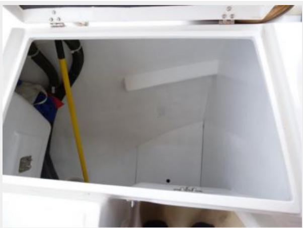
Aft port locker