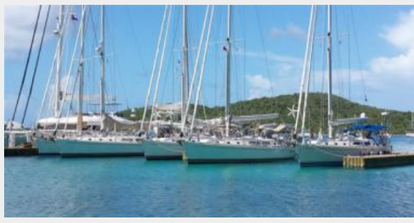
Five Outbound 46's in BVI - Salty Dawg Rally