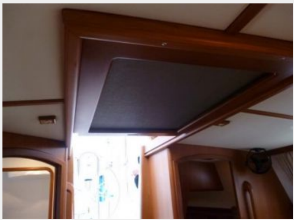
Companionway screen detail