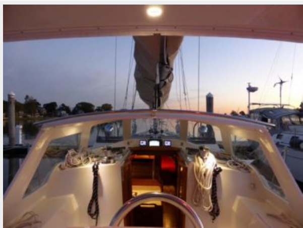
Hard dodger at dusk