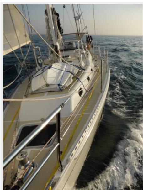
View from bow under sail