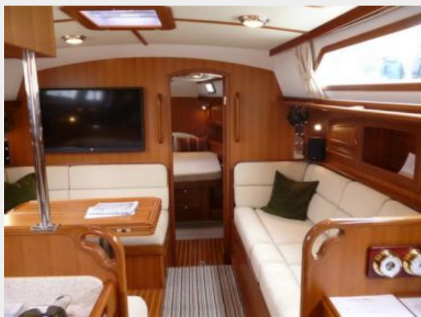
Salon looking forward