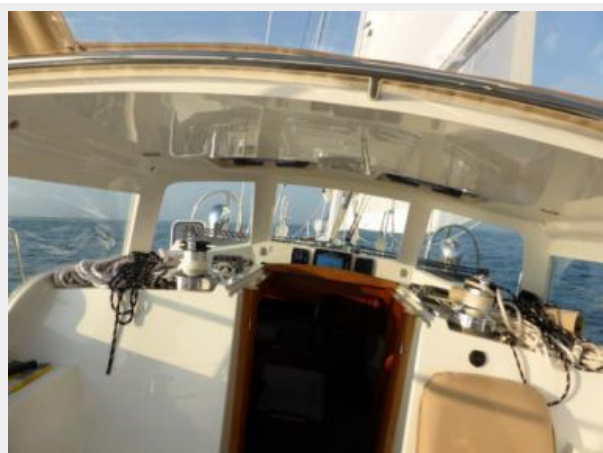
Sightline through hard dodger under sail