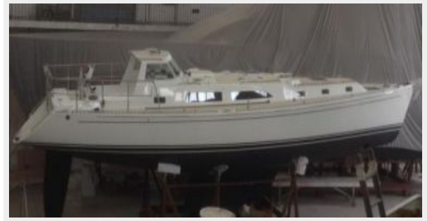
Outbound46 with hard dodger before leaving factory