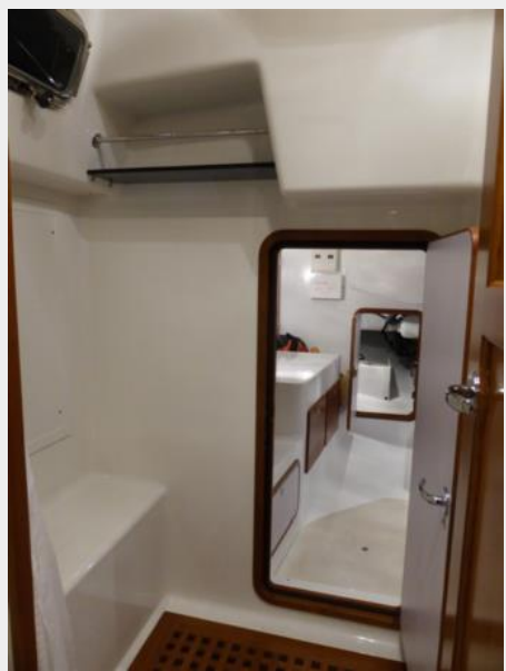
Door to workshop