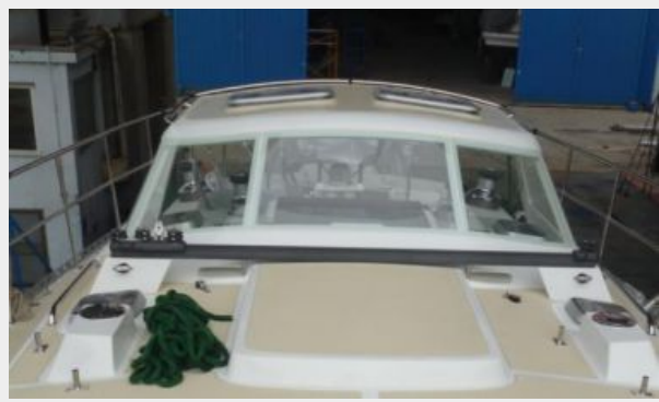
Hard Dodger at factory