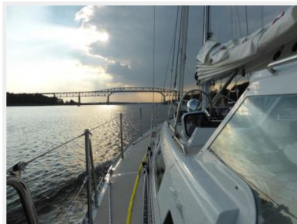
Hard dodger and side deck at dusk