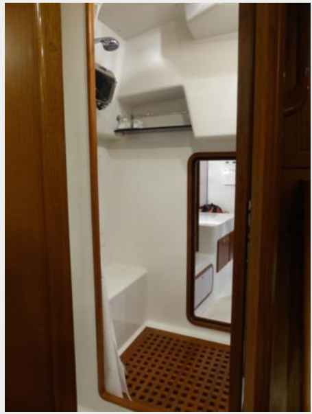
Aft shower and door to work shop