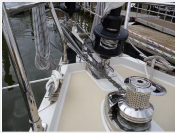
Double bow roller and windlass