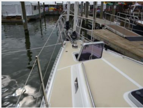
Recessed forward deck hatch