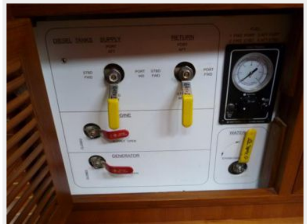
Fuel and water manifolds