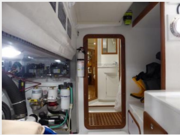
View forward in workshop