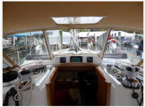
Soft Dodger option