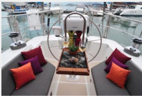
Cockpit with custom cushions