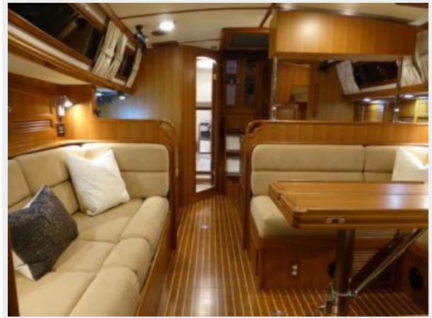
Salon looking aft