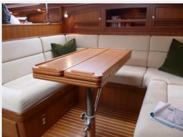
Salon table closed