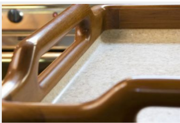
Hand hold in fiddle and counter detail