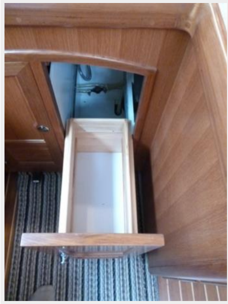
Slide out trash in galley