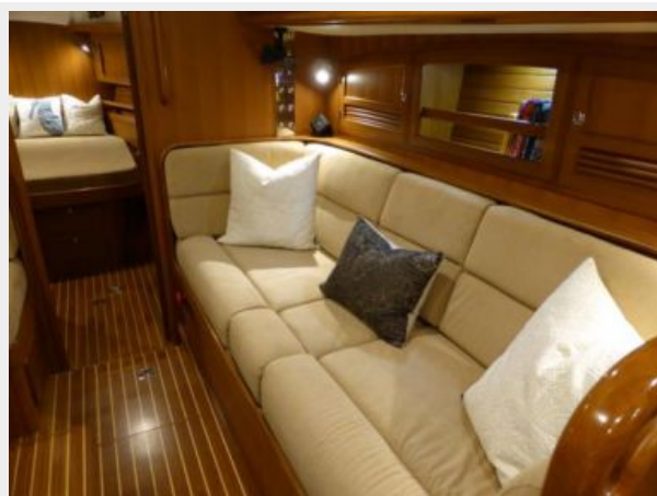
Starboard settee looking forward