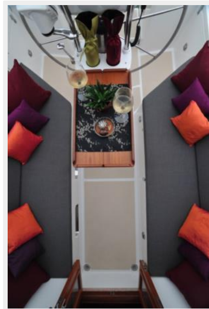
Cockpit view from above