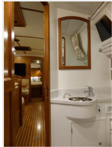
Sink in aft head