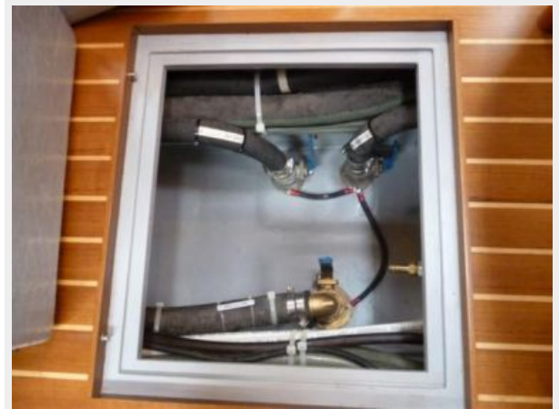
Thru hulls at companionway