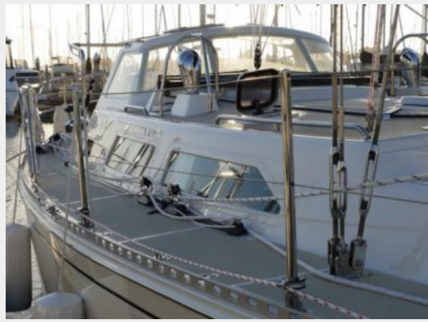
Wide side decks