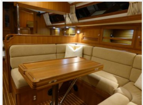
Port settee looking aft