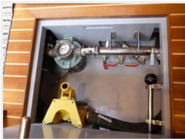
Manual bilge pump and sea water manifold