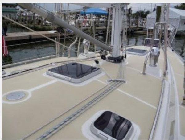
Cabin top looking forward