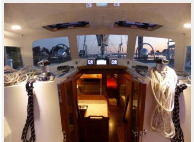
LED lights under hard dodger