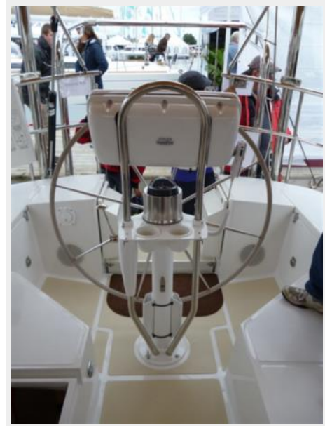
Helm looking aft