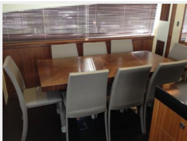
26_2014 73ft Sunseeker Manhattan BORN TO RUN