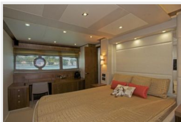
34_2014 73ft Sunseeker Manhattan BORN TO RUN