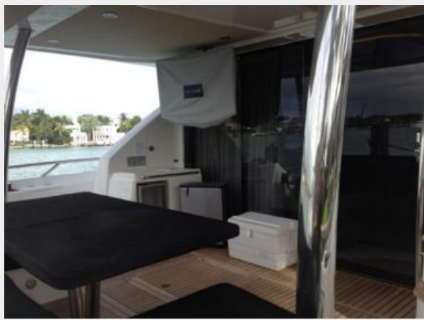
16_2014 73ft Sunseeker Manhattan BORN TO RUN