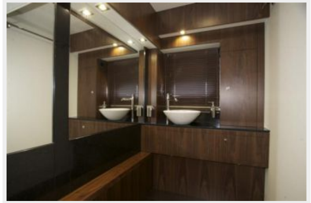
35_2014 73ft Sunseeker Manhattan BORN TO RUN