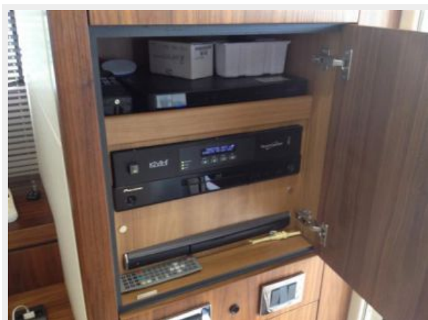
24_2014 73ft Sunseeker Manhattan BORN TO RUN