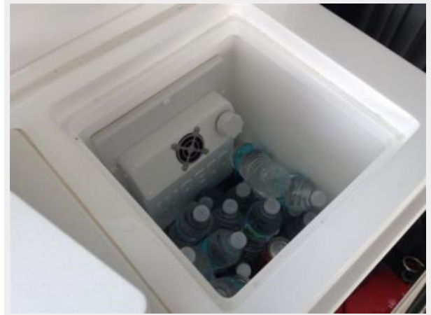
17_2014 73ft Sunseeker Manhattan BORN TO RUN