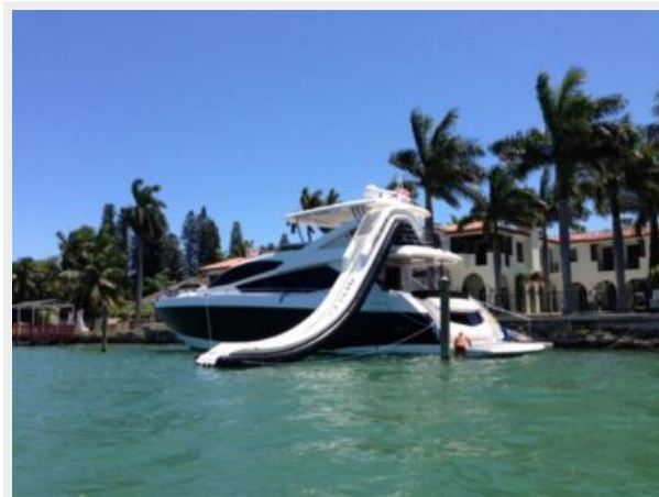
4_2014 73ft Sunseeker Manhattan BORN TO RUN