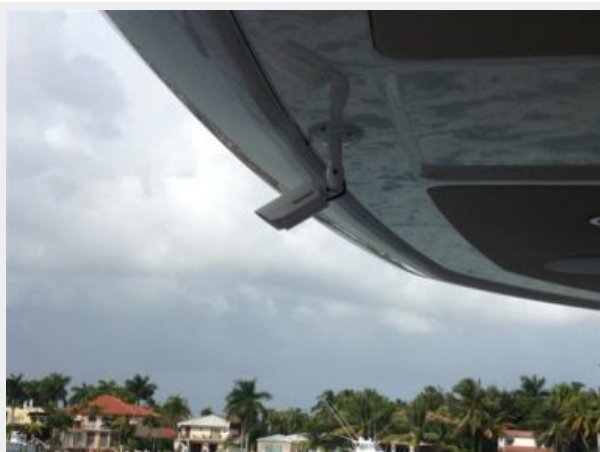
18_2014 73ft Sunseeker Manhattan BORN TO RUN