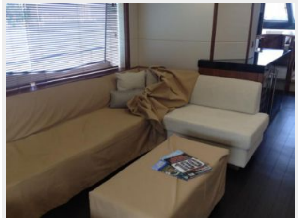
23_2014 73ft Sunseeker Manhattan BORN TO RUN