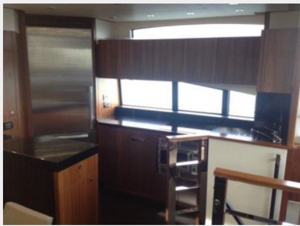
28_2014 73ft Sunseeker Manhattan BORN TO RUN