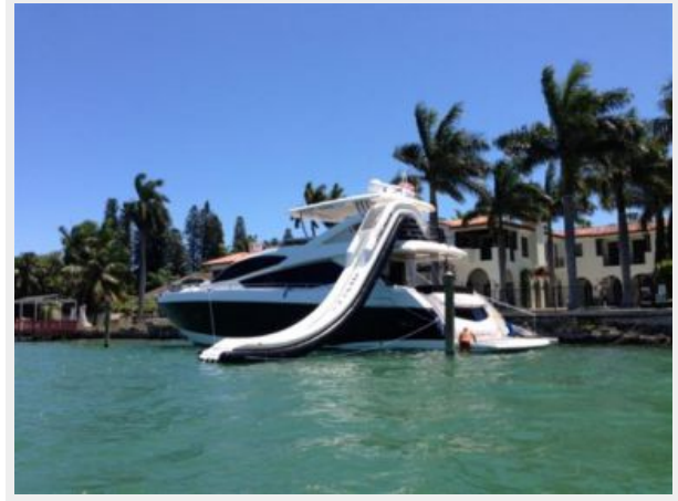
4_2014 73ft Sunseeker Manhattan BORN TO RUN