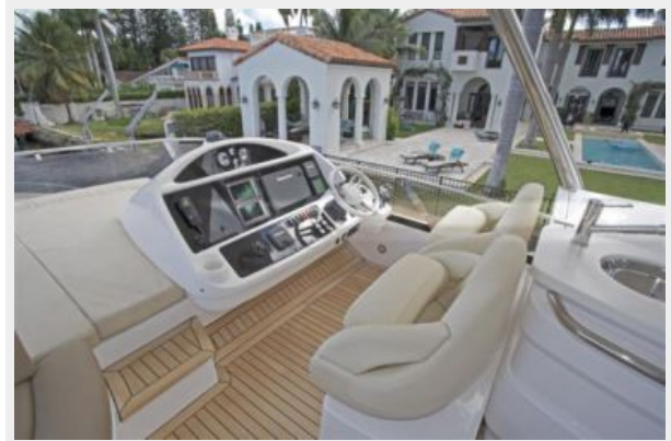
13_2014 73ft Sunseeker Manhattan BORN TO RUN