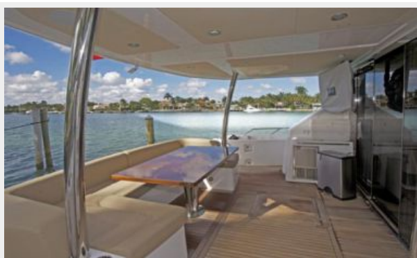
14_2014 73ft Sunseeker Manhattan BORN TO RUN