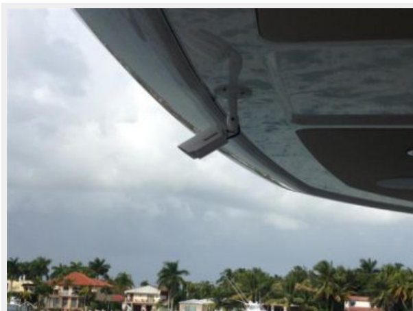
18_2014 73ft Sunseeker Manhattan BORN TO RUN