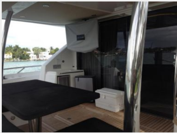
16_2014 73ft Sunseeker Manhattan BORN TO RUN