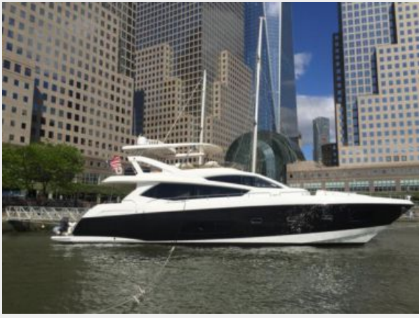
2_2014 73ft Sunseeker Manhattan BORN TO RUN