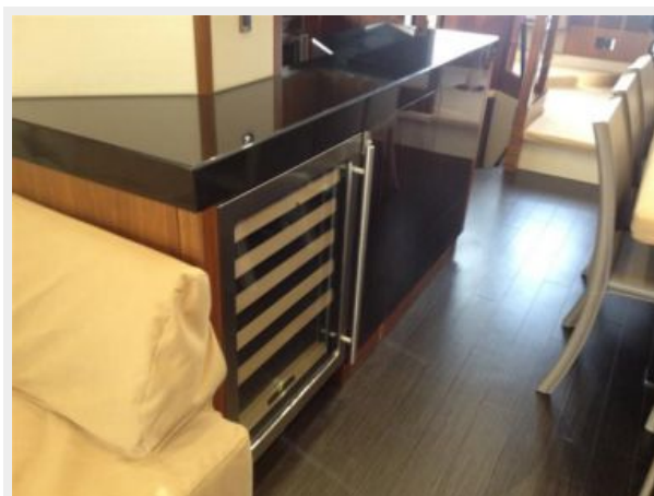
25_2014 73ft Sunseeker Manhattan BORN TO RUN