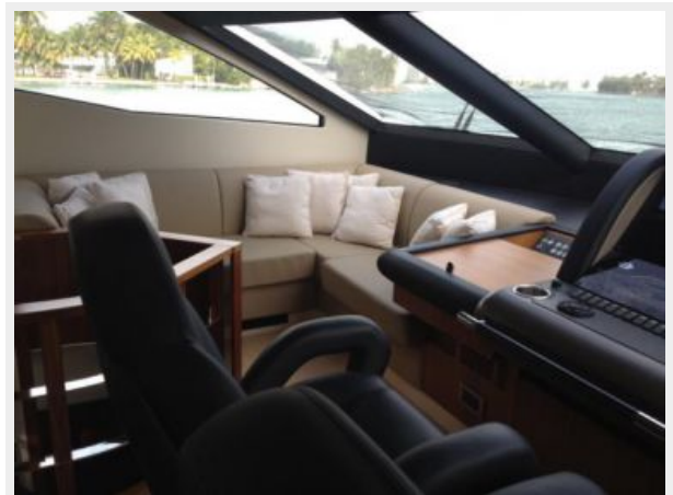
31_2014 73ft Sunseeker Manhattan BORN TO RUN