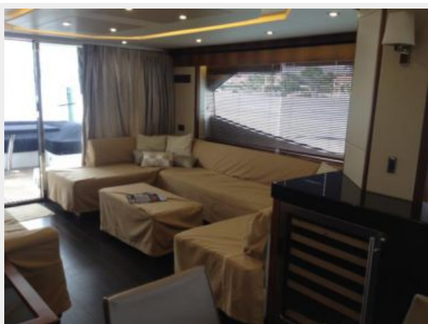
20_2014 73ft Sunseeker Manhattan BORN TO RUN