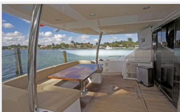
14_2014 73ft Sunseeker Manhattan BORN TO RUN