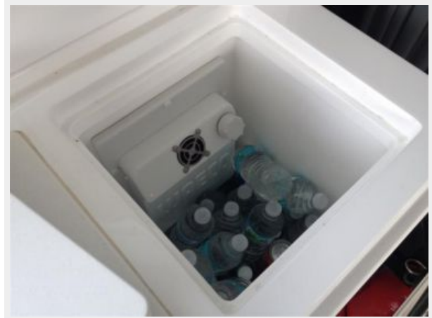
17_2014 73ft Sunseeker Manhattan BORN TO RUN