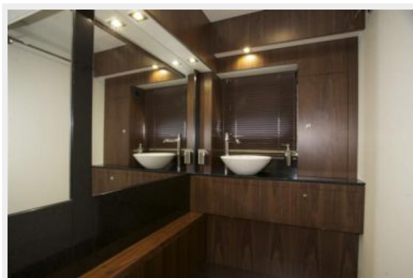
35_2014 73ft Sunseeker Manhattan BORN TO RUN