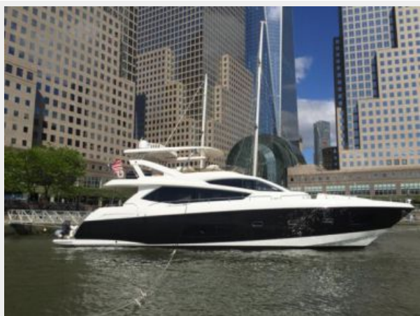
2_2014 73ft Sunseeker Manhattan BORN TO RUN