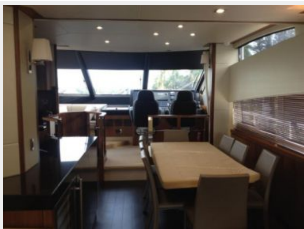
30_2014 73ft Sunseeker Manhattan BORN TO RUN