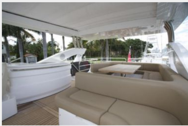
10_2014 73ft Sunseeker Manhattan BORN TO RUN