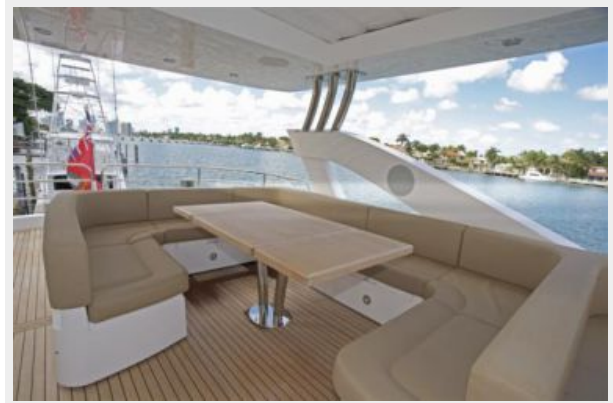
11_2014 73ft Sunseeker Manhattan BORN TO RUN