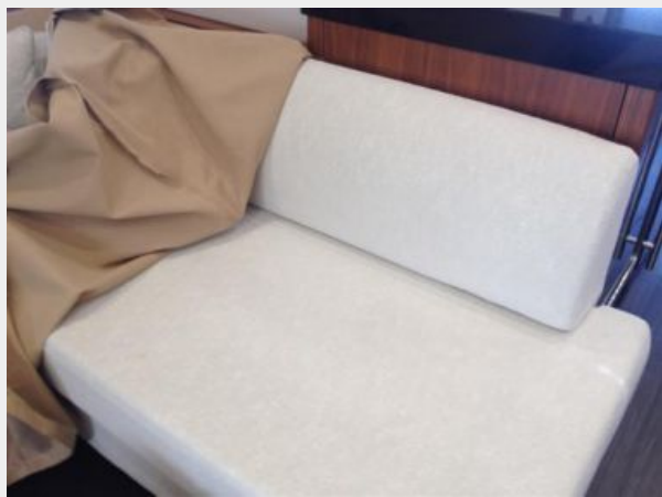
22_2014 73ft Sunseeker Manhattan BORN TO RUN