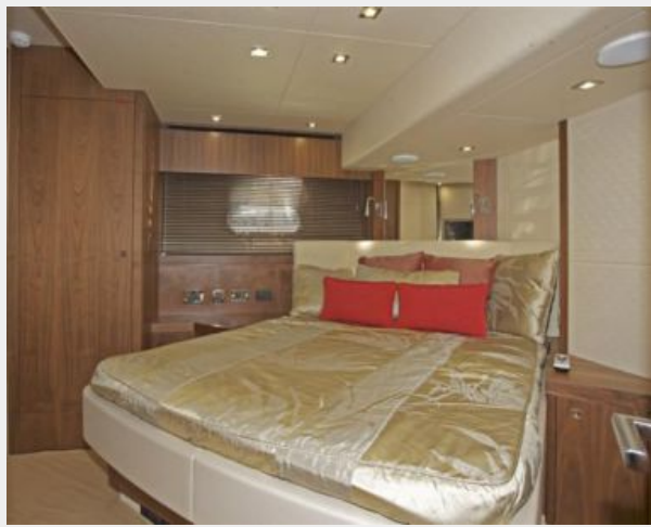
36_2014 73ft Sunseeker Manhattan BORN TO RUN