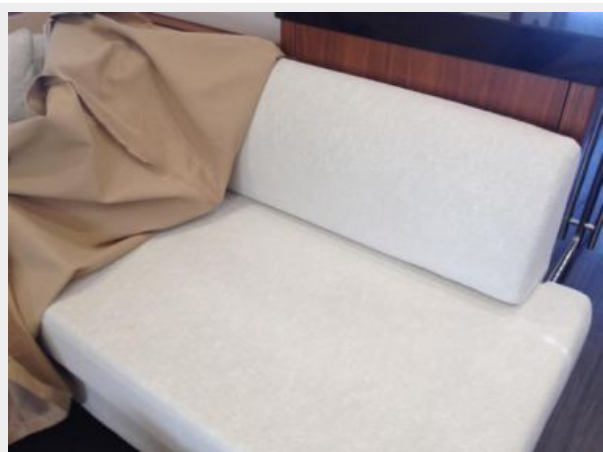
22_2014 73ft Sunseeker Manhattan BORN TO RUN