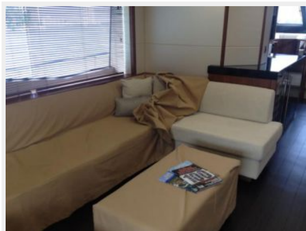
23_2014 73ft Sunseeker Manhattan BORN TO RUN