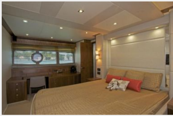
34_2014 73ft Sunseeker Manhattan BORN TO RUN