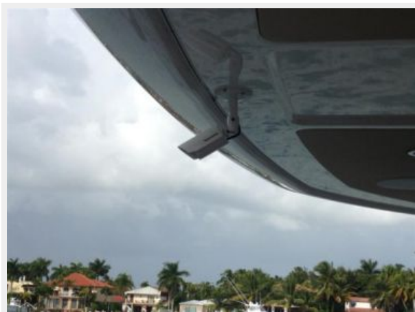
18_2014 73ft Sunseeker Manhattan BORN TO RUN