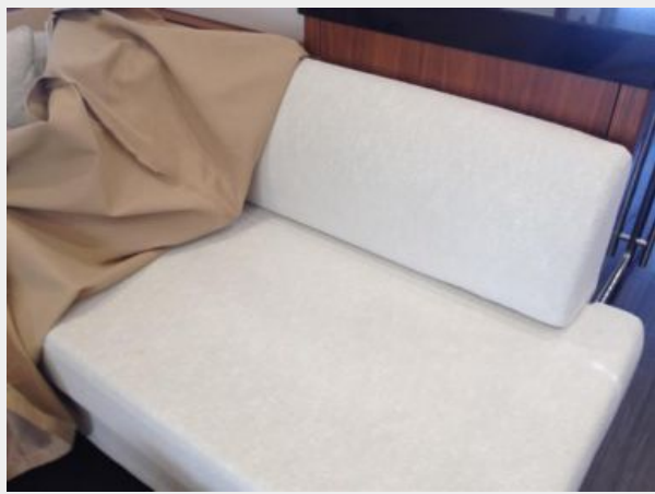
22_2014 73ft Sunseeker Manhattan BORN TO RUN