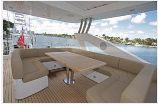
11_2014 73ft Sunseeker Manhattan BORN TO RUN