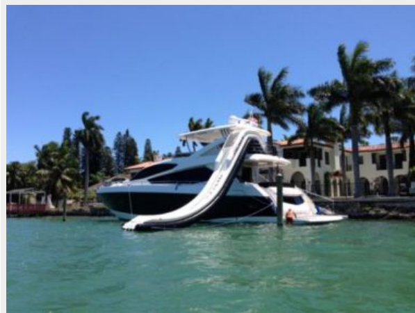
4_2014 73ft Sunseeker Manhattan BORN TO RUN 5_2014 73ft Sunseeker Manhattan BORN TO RUN