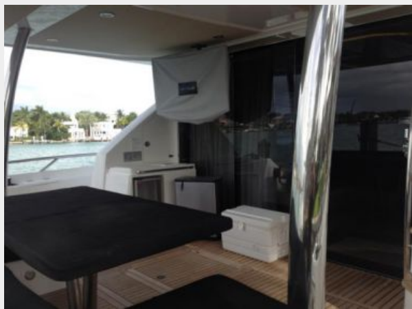
16_2014 73ft Sunseeker Manhattan BORN TO RUN