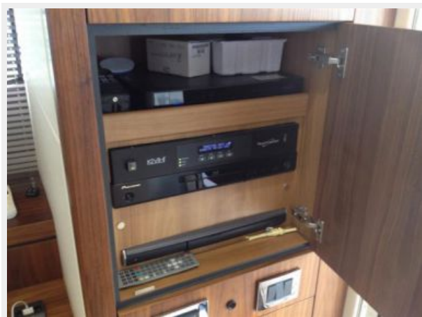
24_2014 73ft Sunseeker Manhattan BORN TO RUN