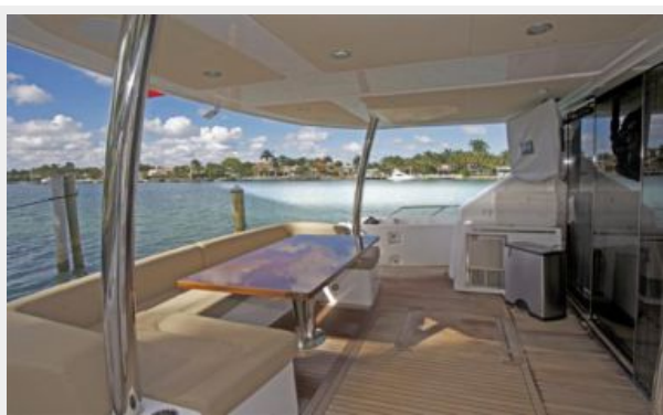
14_2014 73ft Sunseeker Manhattan BORN TO RUN