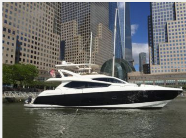
2_2014 73ft Sunseeker Manhattan BORN TO RUN 3_2014 73ft Sunseeker Manhattan BORN TO RUN