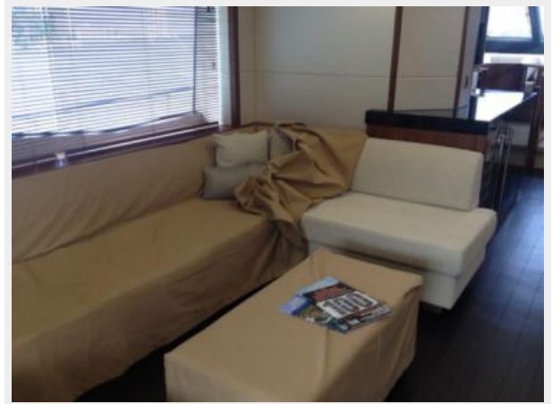
23_2014 73ft Sunseeker Manhattan BORN TO RUN