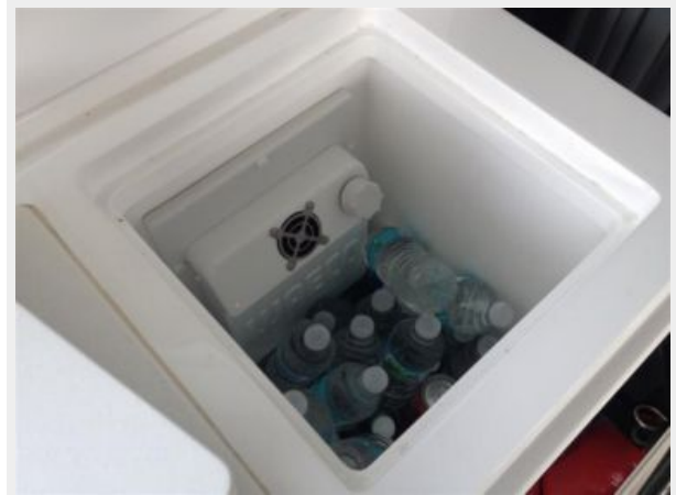
17_2014 73ft Sunseeker Manhattan BORN TO RUN