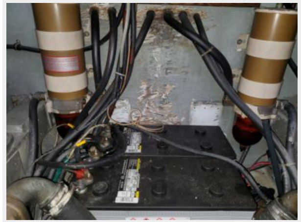
Batteries and Racors