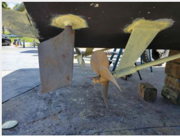
Starboard prop, shaft, strut, rudder