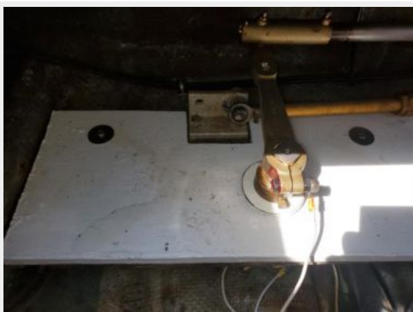
New rudder bearing and support table (starboard)