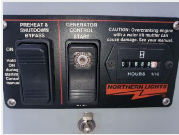
Generator hour meter