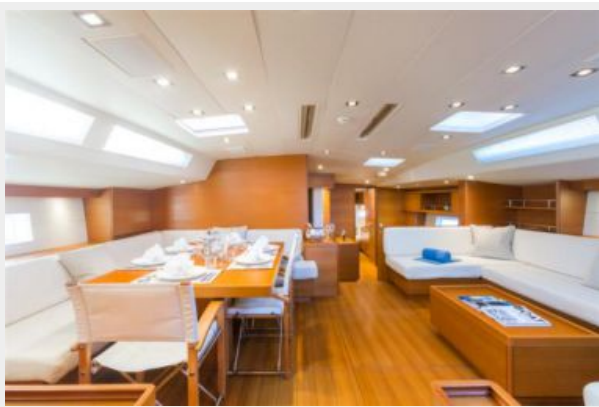
BLUES_Lo-0772-credit Quin BISSET