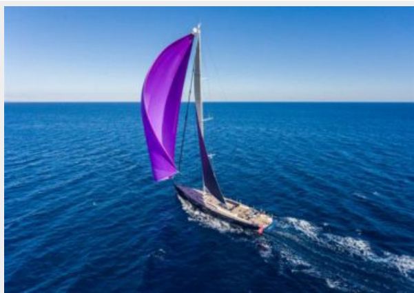
BLUES_Lo-0080-credit Quin BISSET