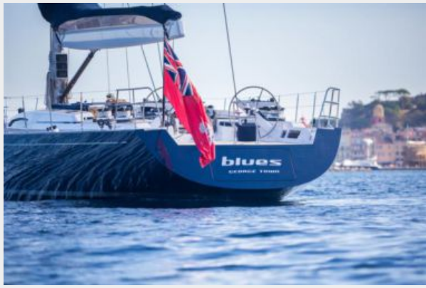
BLUES_Lo-0967-credit Quin BISSET