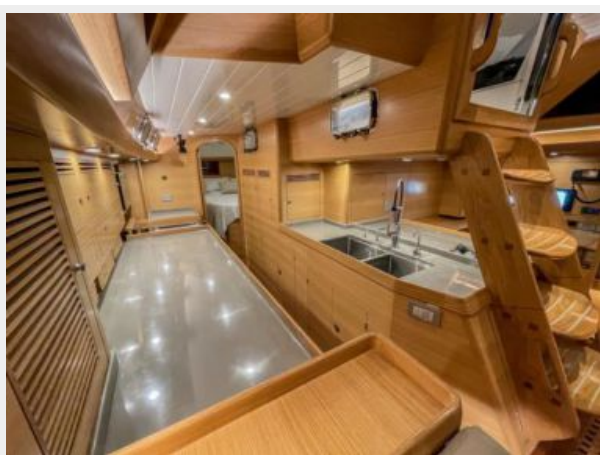
Galley looking aft