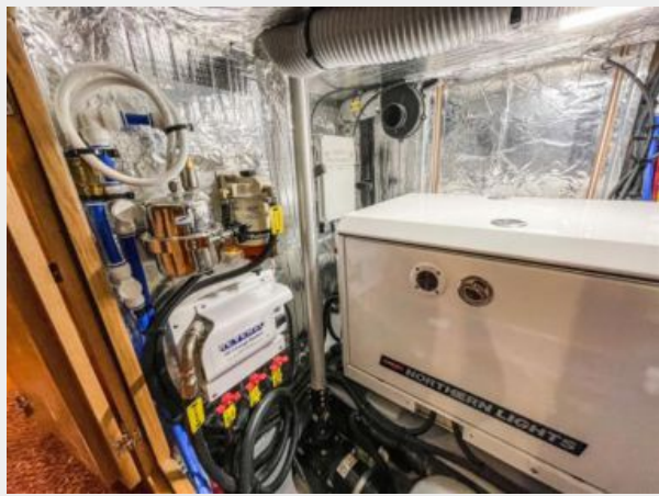
GEnset access and Oil change pump