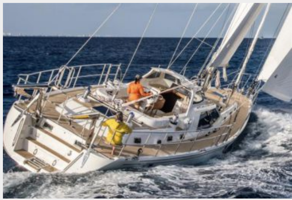
BW56 Sea Trials 2