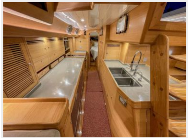
Galley Aft 2