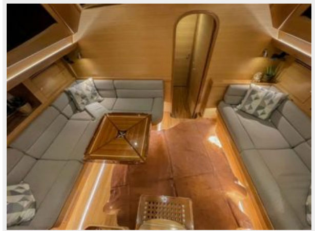
Saloon from Companionway