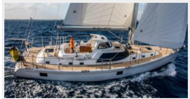
Pneumatic Sea Trials FL