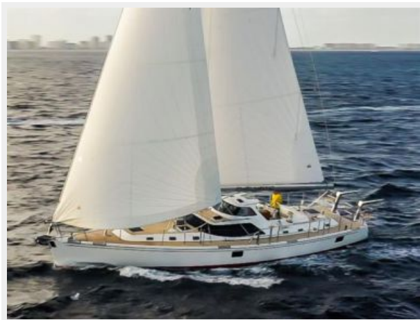
FLL Seatrials BW56