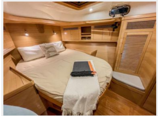
Forward Cabin BW56