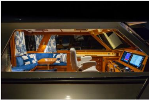
Helm and Salon