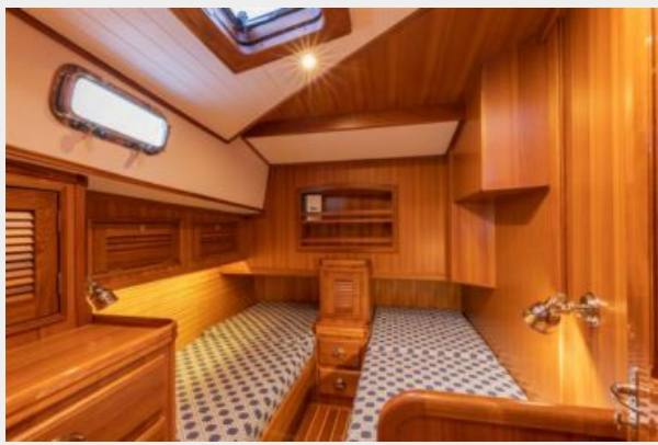
Guest Twin Cabin