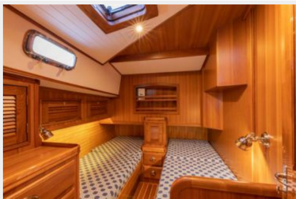
Guest Twin Cabin