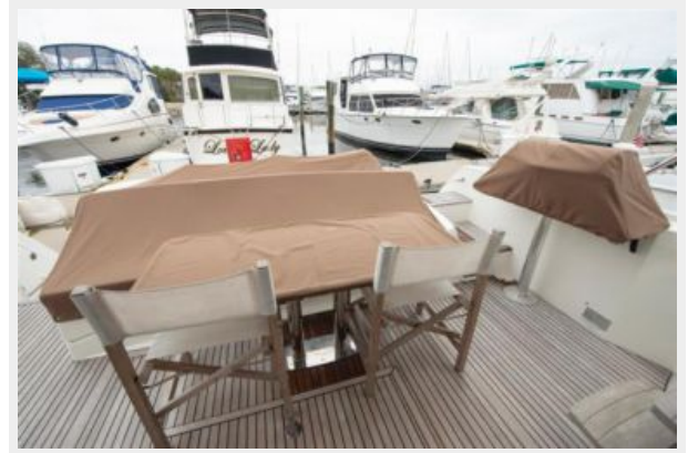
Layout Photo 2