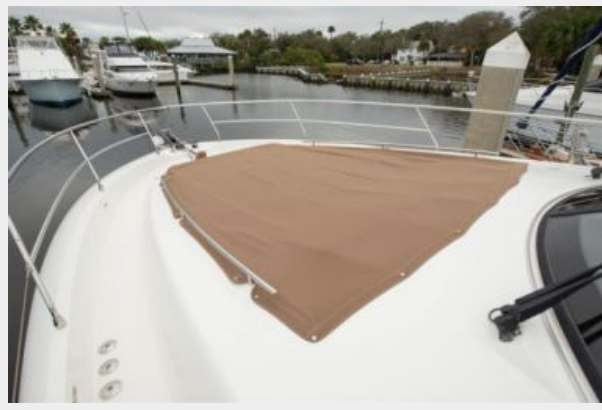
Layout Photo 1