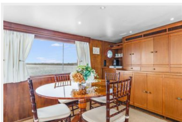
Dining in Main Saloon