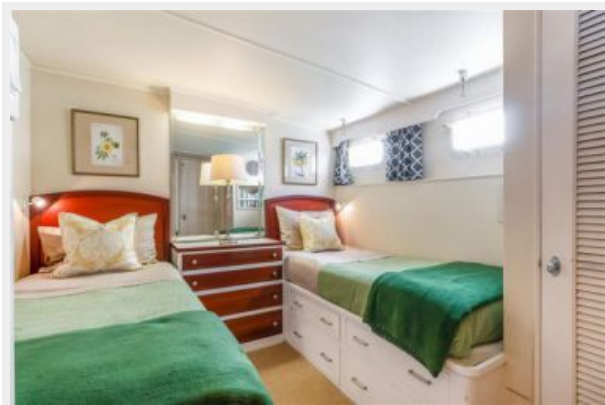
Twin Guest Cabin 2