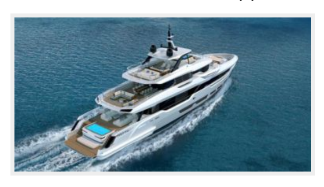
BAGLIETTO DOM133 (4)