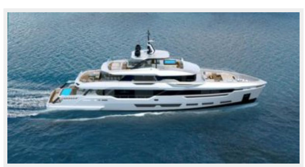
33 (1) BAGLIETTO DOM133 (2)