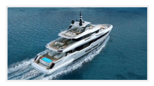
BAGLIETTO DOM133 (3)