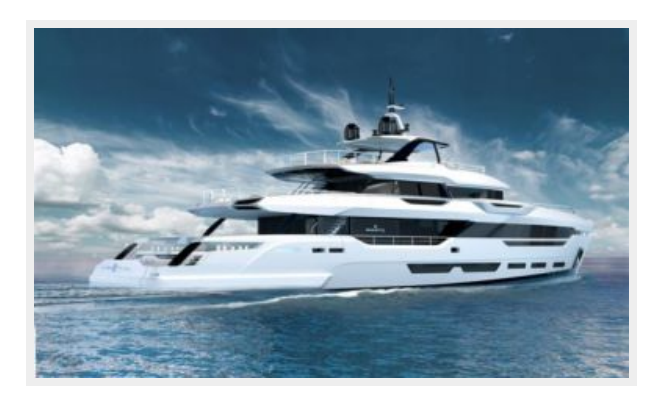
BAGLIETTO DOM133 (5)