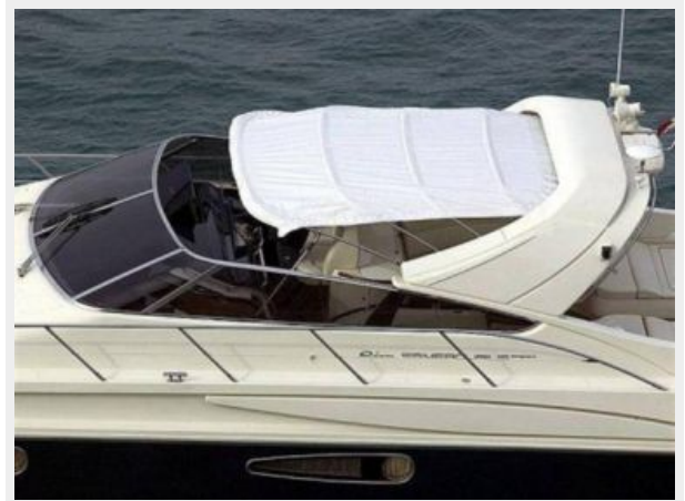
Riva 59 Sister Bimini Extended ARCH