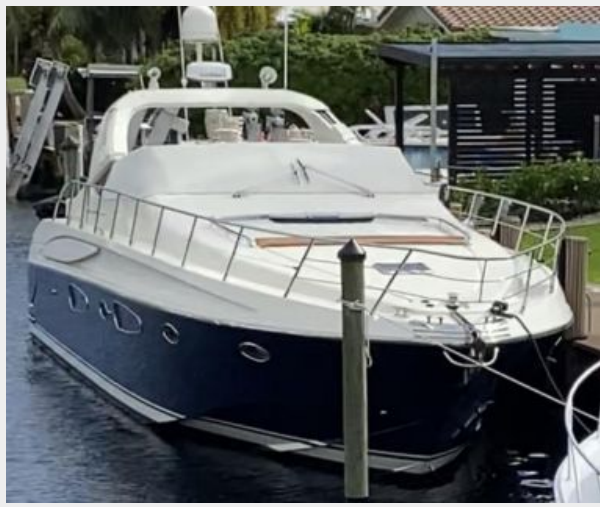
Riva 59 Covered0