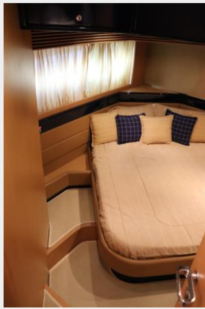
Riva 59 AFT Master1