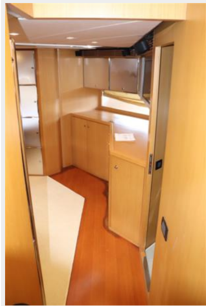
Riva 59 STBD Galley0