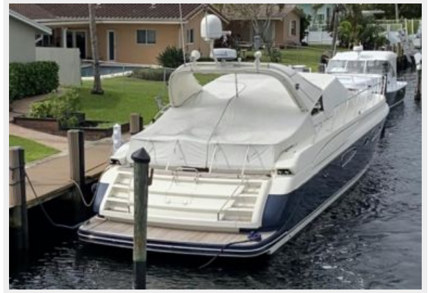
Riva 59 Covered2