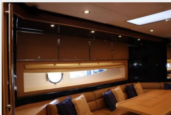
Riva 59 Salon Port Table1