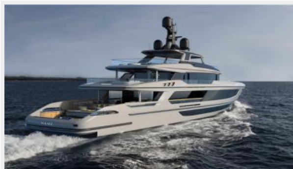
BAGLIETTO T52_52MT_HYBRID_MOTORYACHT 2