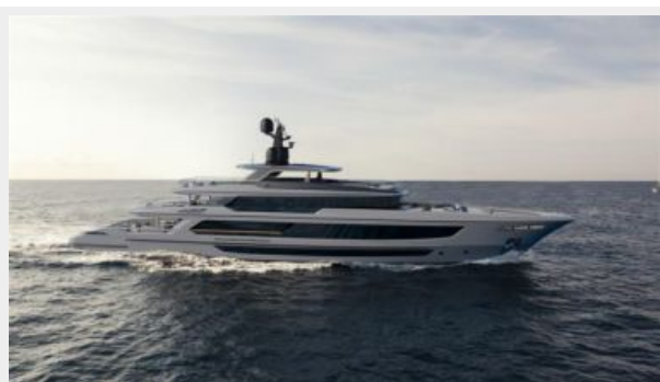
BAGLIETTO T52_52MT_HYBRID_MOTORYACHT 3