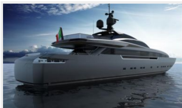
BAGLIETTO 43 FAST HARDTOP