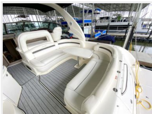
Cockpit seating area