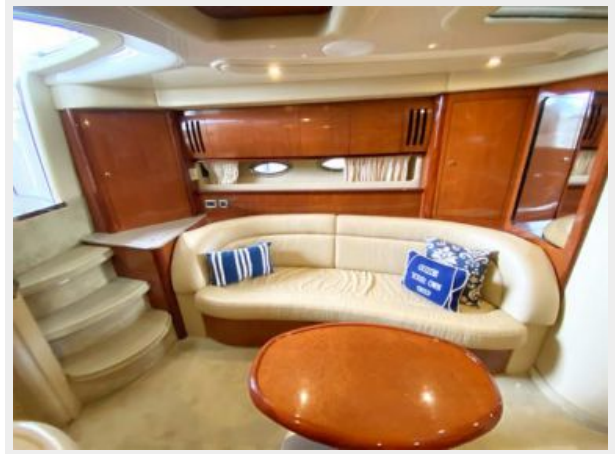
Skylight in the salon