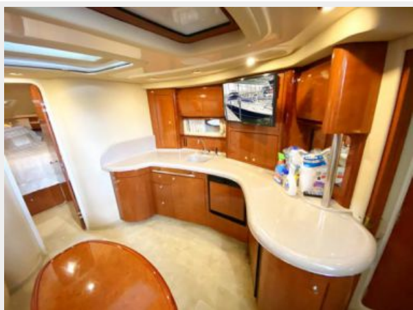
Galley view 2