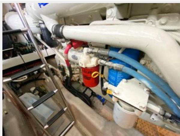
Engine room view 3