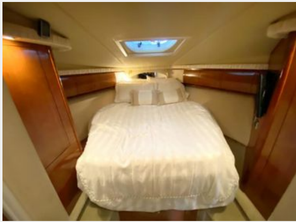
TV in the master stateroom