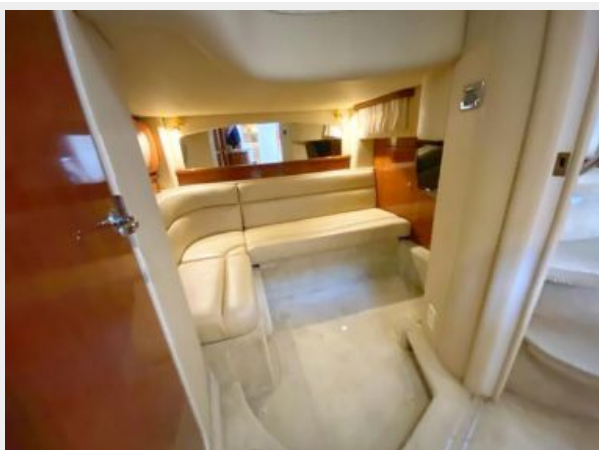
Aft cabin view 2