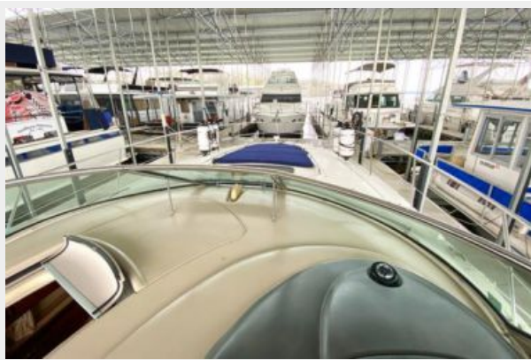
Stbd side deck