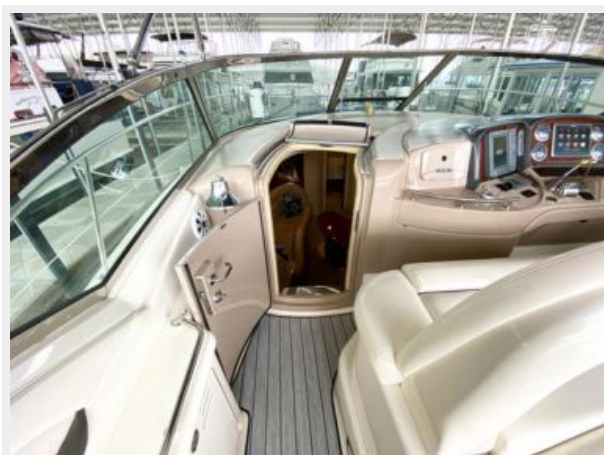
Entry to the salon