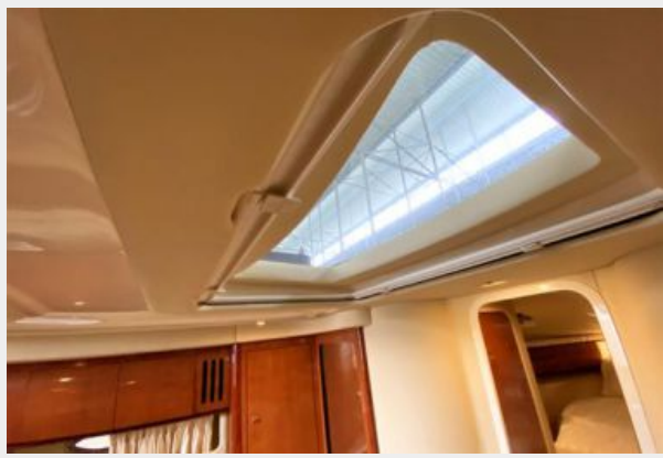
Skylight in the salon