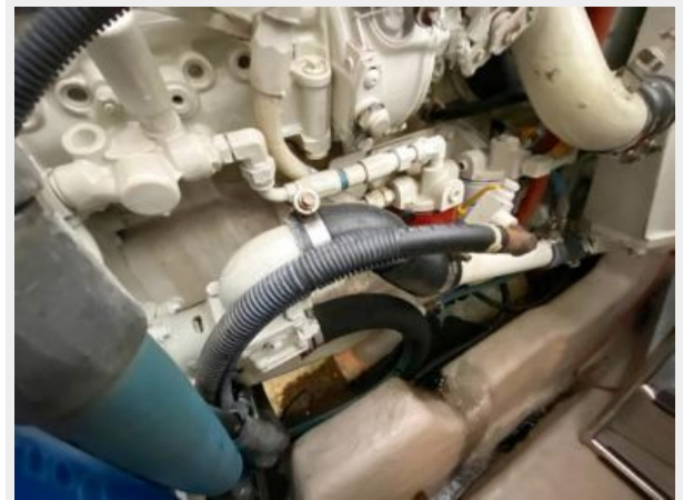
Engine room view 2