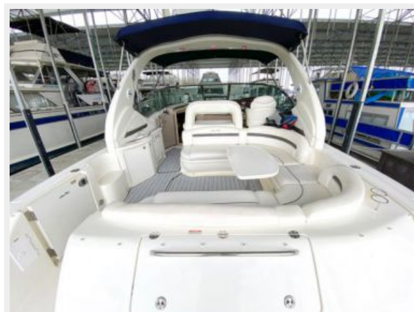
Cockpit seating area