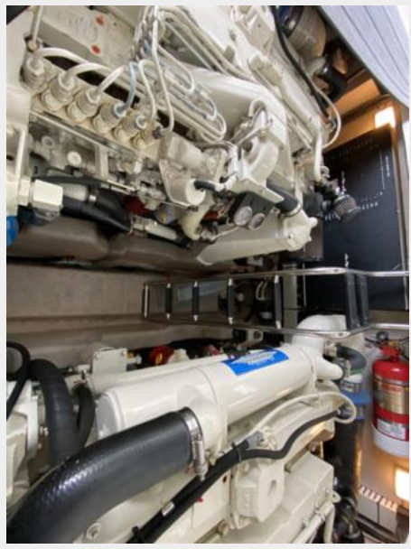
Engine room view 2