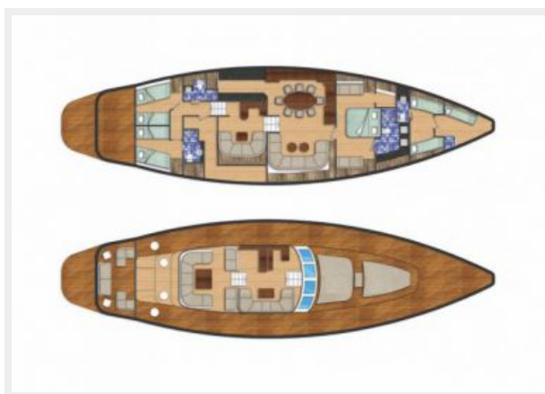
GA Sonbird of London