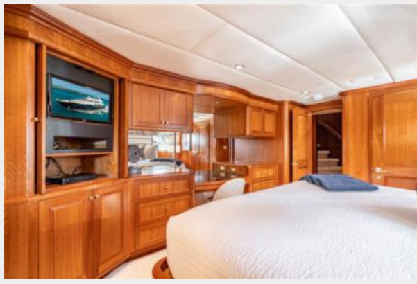
Queen Guest Stateroom