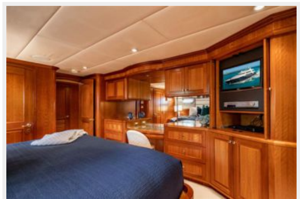
King Guest Stateroom