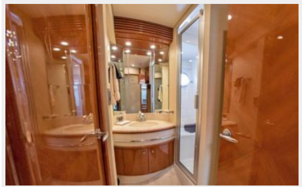
Port Guest Stateroom Head