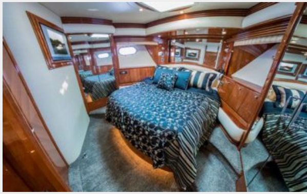
Forward VIP Guest Stateroom