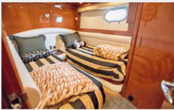
Port Guest Stateroom