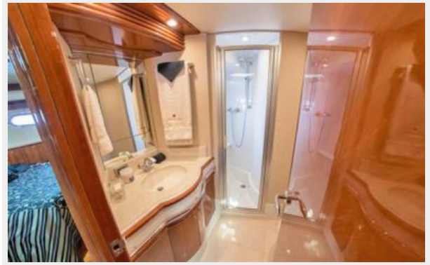
Forward VIP Guest Stateroom Head