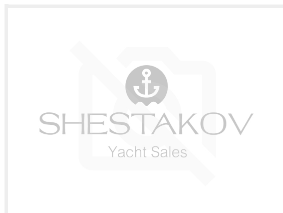
Ariel hauled out web1