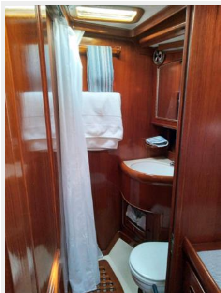
Guest Head and Shower