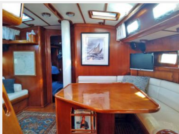
Salon, Stbd., Fwd.