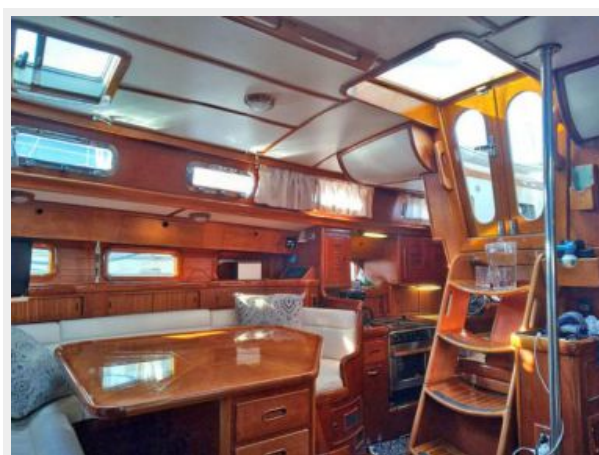
Salon, Stbd. Aft, to Galley