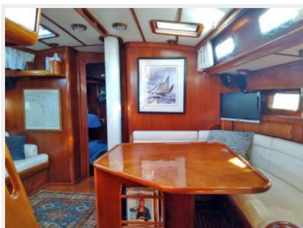
Salon, Stbd., Fwd.