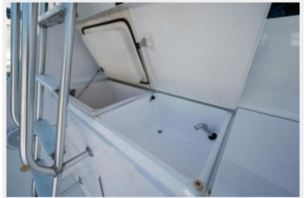
15_1998 55ft Viking 55 Convertible GOLDRUSH