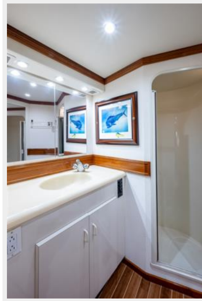
45_1998 55ft Viking 55 Convertible GOLDRUSH