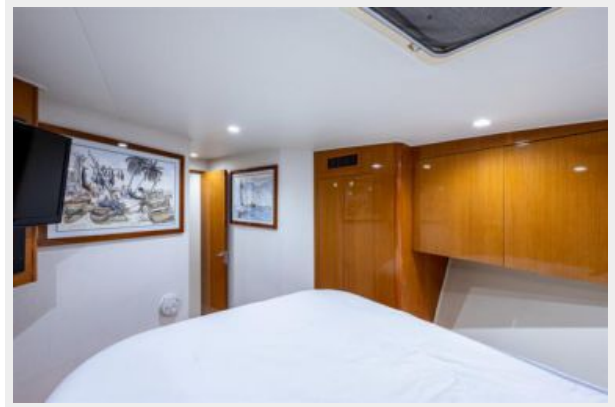
49_1998 55ft Viking 55 Convertible GOLDRUSH