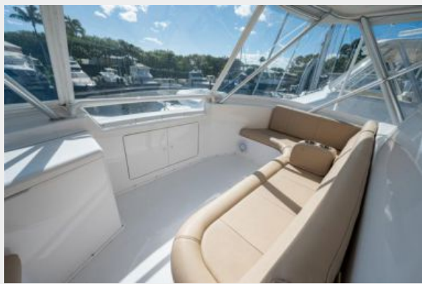
24_1998 55ft Viking 55 Convertible GOLDRUSH