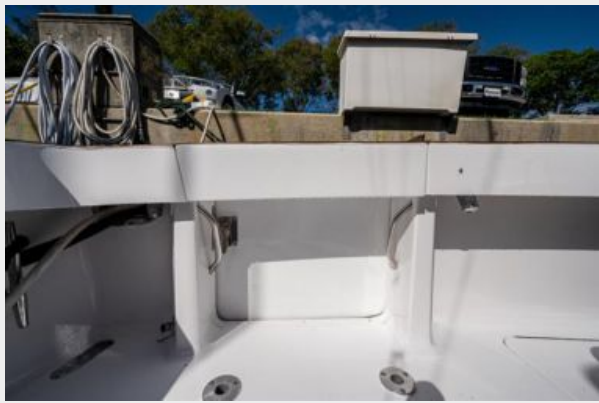
14_1998 55ft Viking 55 Convertible GOLDRUSH