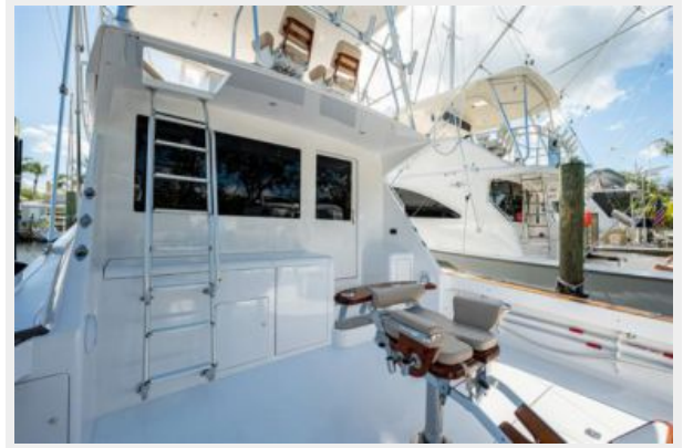
13_1998 55ft Viking 55 Convertible GOLDRUSH