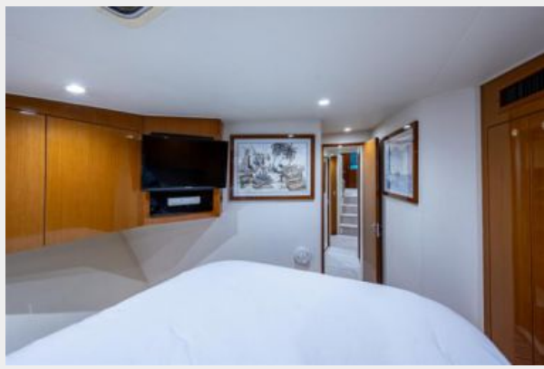
48_1998 55ft Viking 55 Convertible GOLDRUSH