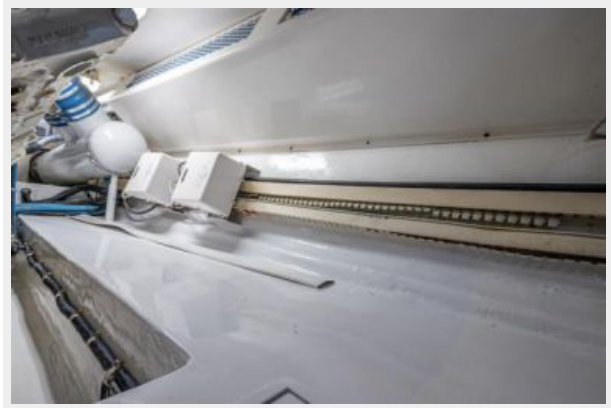
69_1998 55ft Viking 55 Convertible GOLDRUSH