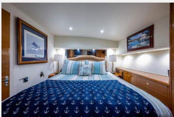
40_1998 55ft Viking 55 Convertible GOLDRUSH