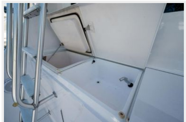
15_1998 55ft Viking 55 Convertible GOLDRUSH