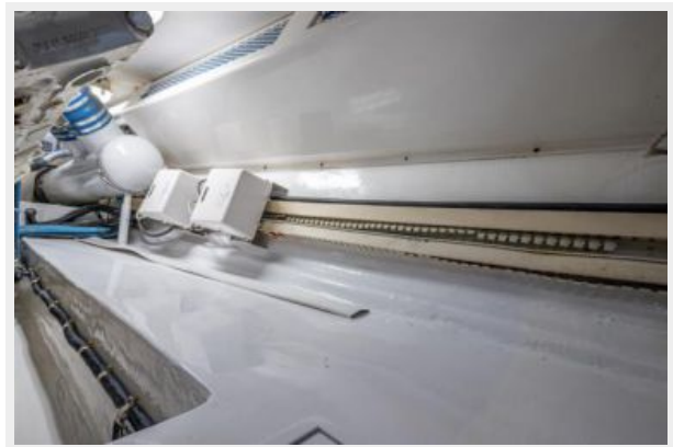
69_1998 55ft Viking 55 Convertible GOLDRUSH