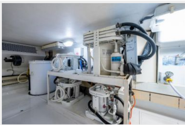
68_1998 55ft Viking 55 Convertible GOLDRUSH