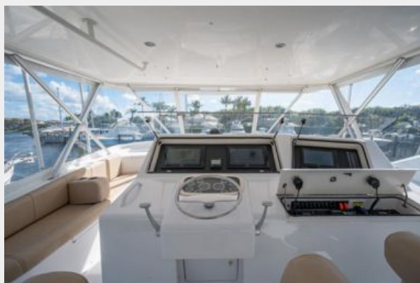
20_1998 55ft Viking 55 Convertible GOLDRUSH