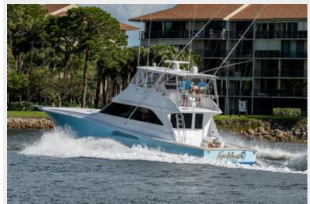
9_1998 55ft Viking 55 Convertible GOLDRUSH