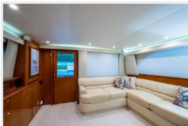
28_1998 55ft Viking 55 Convertible GOLDRUSH