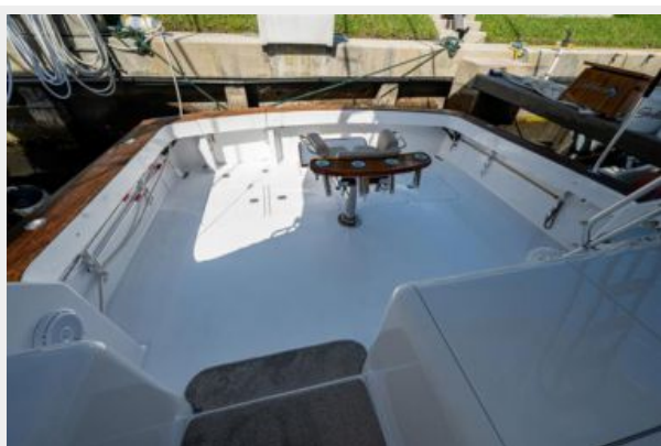
16_1998 55ft Viking 55 Convertible GOLDRUSH