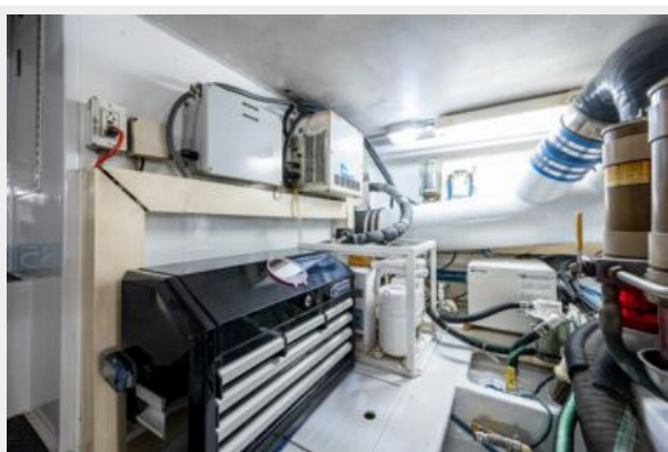
70_1998 55ft Viking 55 Convertible GOLDRUSH