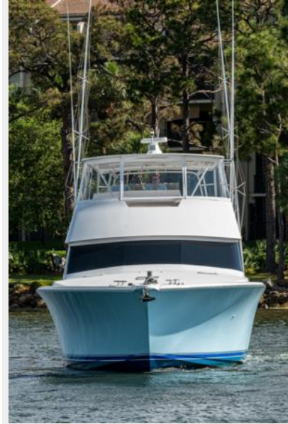
3_1998 55ft Viking 55 Convertible GOLDRUSH