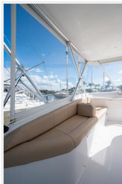
25_1998 55ft Viking 55 Convertible GOLDRUSH