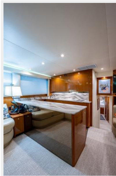
33_1998 55ft Viking 55 Convertible GOLDRUSH