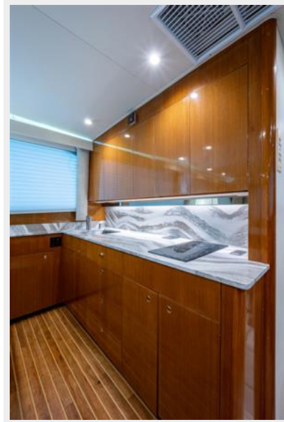
35_1998 55ft Viking 55 Convertible GOLDRUSH