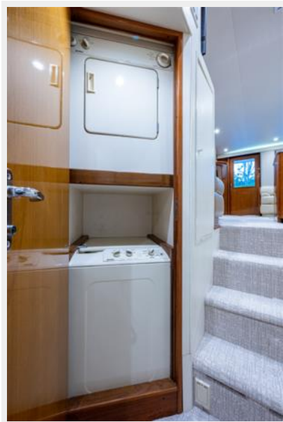
30_1998 55ft Viking 55 Convertible GOLDRUSH