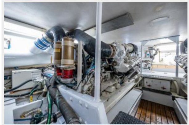
59_1998 55ft Viking 55 Convertible GOLDRUSH