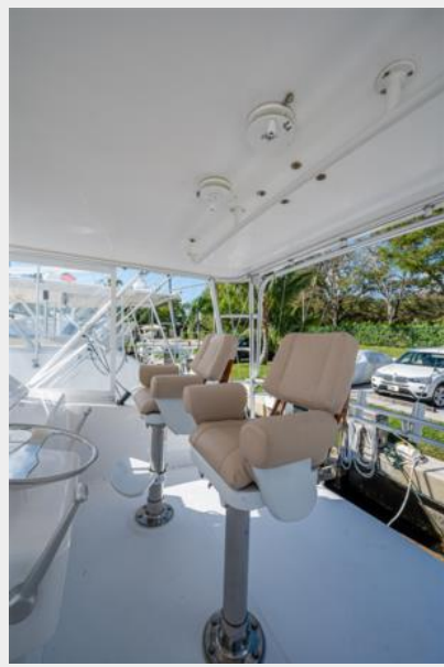
18_1998 55ft Viking 55 Convertible GOLDRUSH