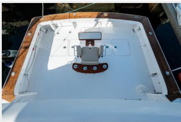
10_1998 55ft Viking 55 Convertible GOLDRUSH