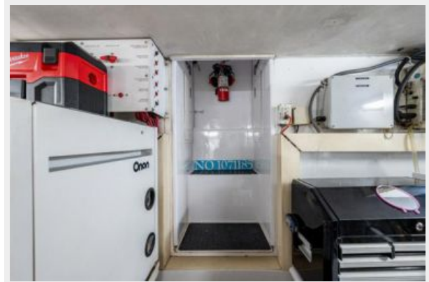
61_1998 55ft Viking 55 Convertible GOLDRUSH