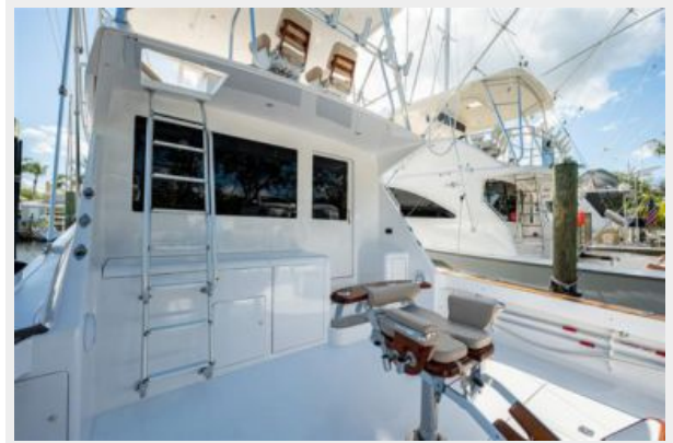
13_1998 55ft Viking 55 Convertible GOLDRUSH