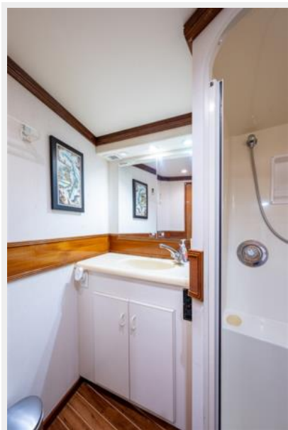
54_1998 55ft Viking 55 Convertible GOLDRUSH