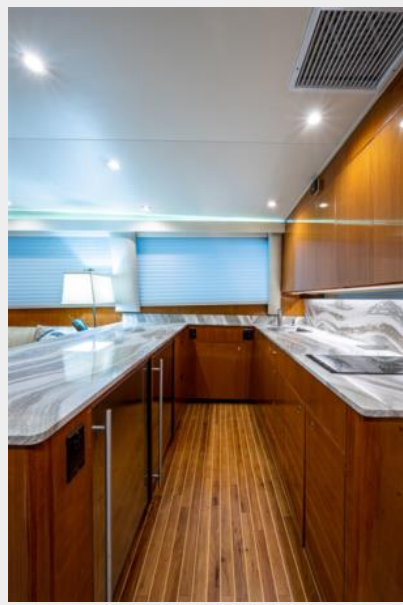
34_1998 55ft Viking 55 Convertible GOLDRUSH