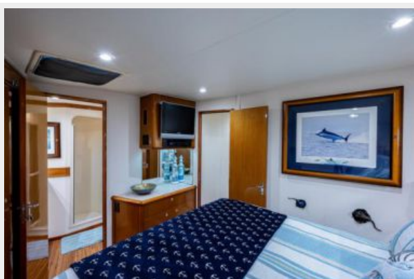
42_1998 55ft Viking 55 Convertible GOLDRUSH