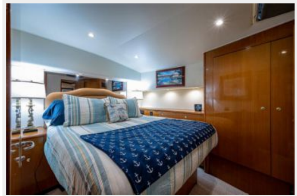
41_1998 55ft Viking 55 Convertible GOLDRUSH