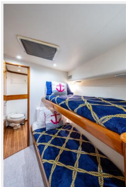
50_1998 55ft Viking 55 Convertible GOLDRUSH