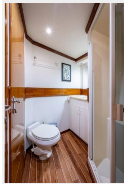
53_1998 55ft Viking 55 Convertible GOLDRUSH