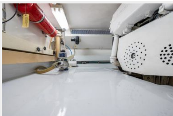
64_1998 55ft Viking 55 Convertible GOLDRUSH