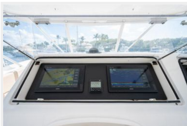
22_1998 55ft Viking 55 Convertible GOLDRUSH