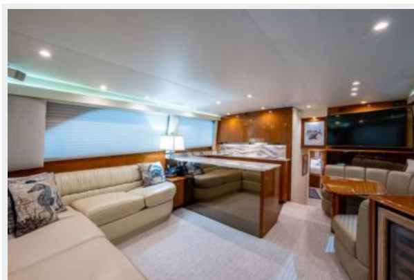
27_1998 55ft Viking 55 Convertible GOLDRUSH