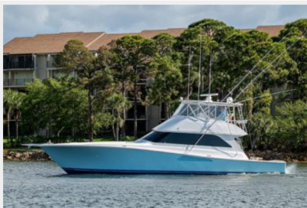
4_1998 55ft Viking 55 Convertible GOLDRUSH