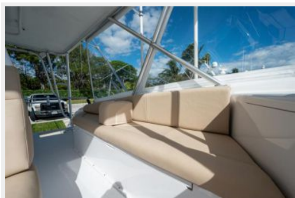
26_1998 55ft Viking 55 Convertible GOLDRUSH