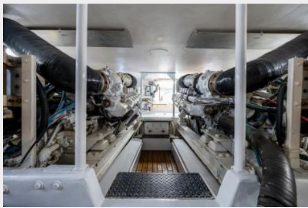
56_1998 55ft Viking 55 Convertible GOLDRUSH