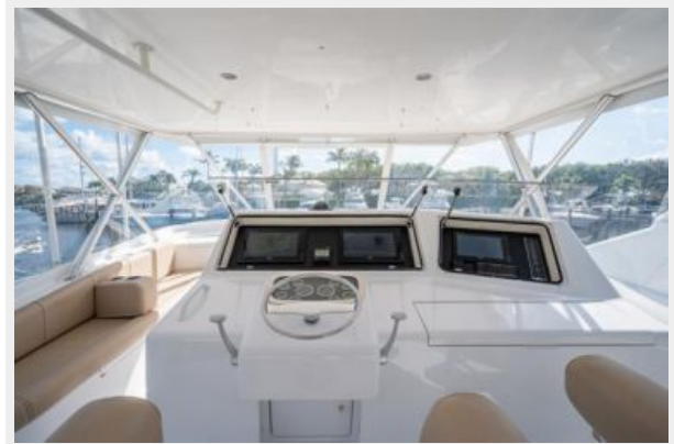
19_1998 55ft Viking 55 Convertible GOLDRUSH