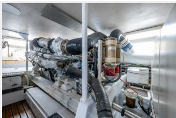
58_1998 55ft Viking 55 Convertible GOLDRUSH