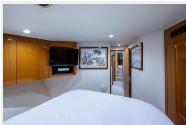
48_1998 55ft Viking 55 Convertible GOLDRUSH