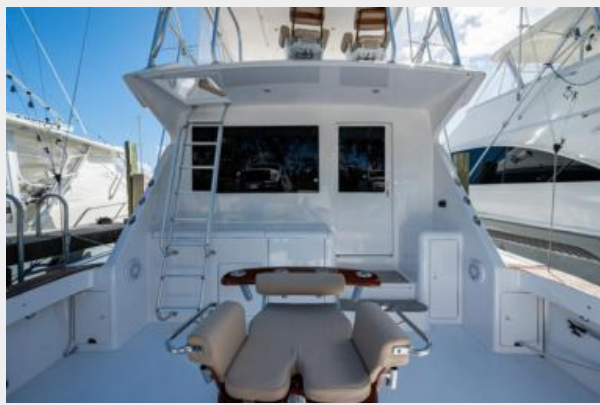
12_1998 55ft Viking 55 Convertible GOLDRUSH