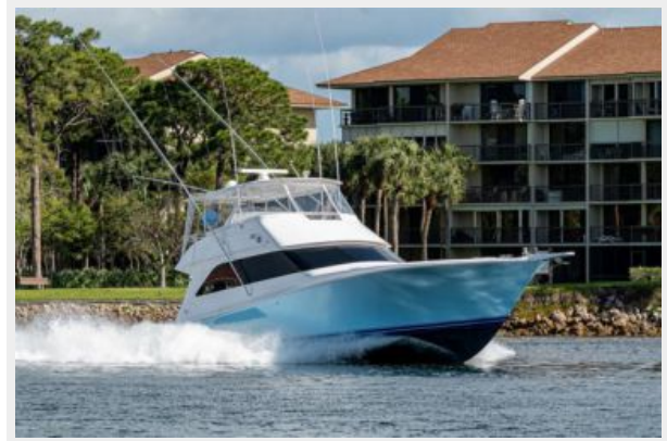
7_1998 55ft Viking 55 Convertible GOLDRUSH