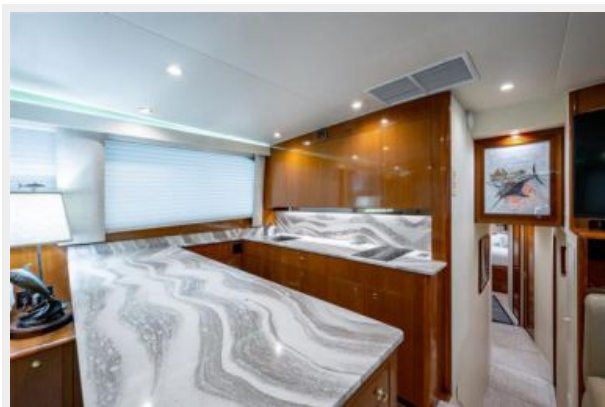
32_1998 55ft Viking 55 Convertible GOLDRUSH