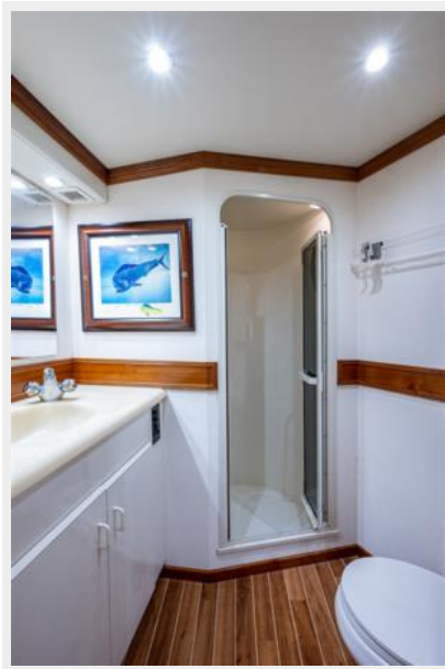
44_1998 55ft Viking 55 Convertible GOLDRUSH