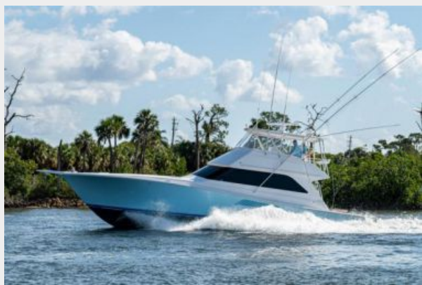
8_1998 55ft Viking 55 Convertible GOLDRUSH