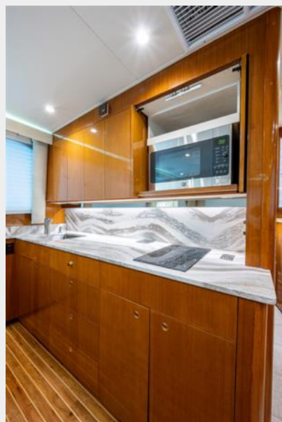
36_1998 55ft Viking 55 Convertible GOLDRUSH