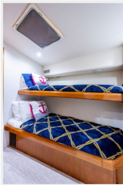
52_1998 55ft Viking 55 Convertible GOLDRUSH