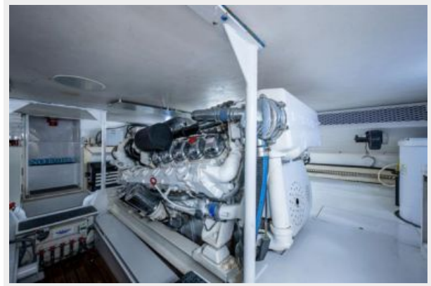
67_1998 55ft Viking 55 Convertible GOLDRUSH