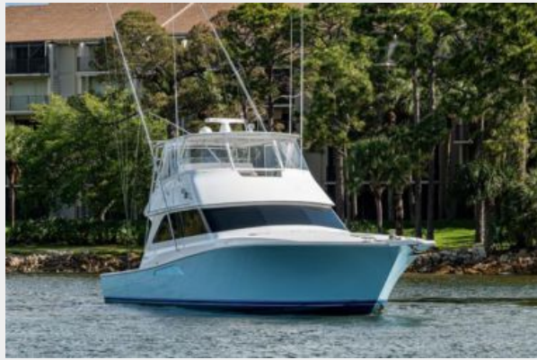
2_1998 55ft Viking 55 Convertible GOLDRUSH