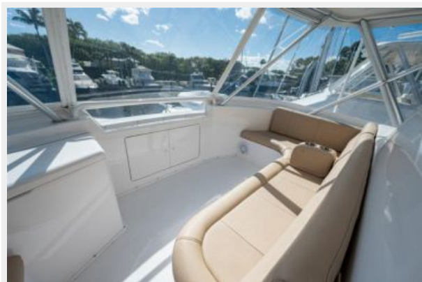
24_1998 55ft Viking 55 Convertible GOLDRUSH