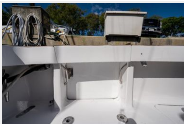
14_1998 55ft Viking 55 Convertible GOLDRUSH