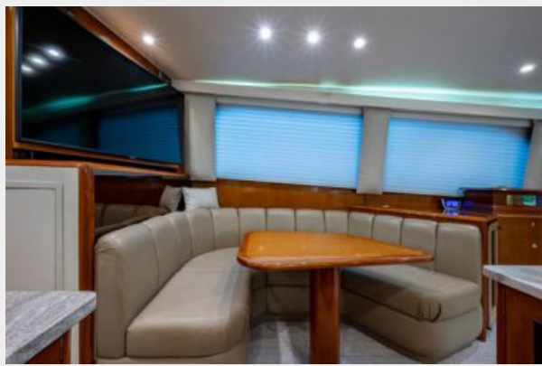
38_1998 55ft Viking 55 Convertible GOLDRUSH