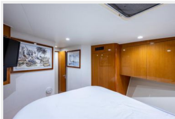
49_1998 55ft Viking 55 Convertible GOLDRUSH