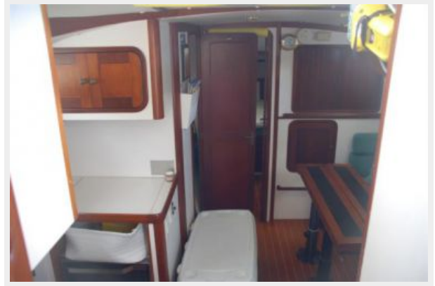
Galley 1 - Copy