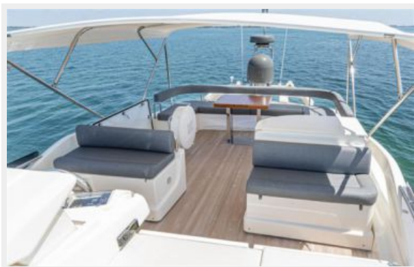
Flybridge Seating and Grill / Bar