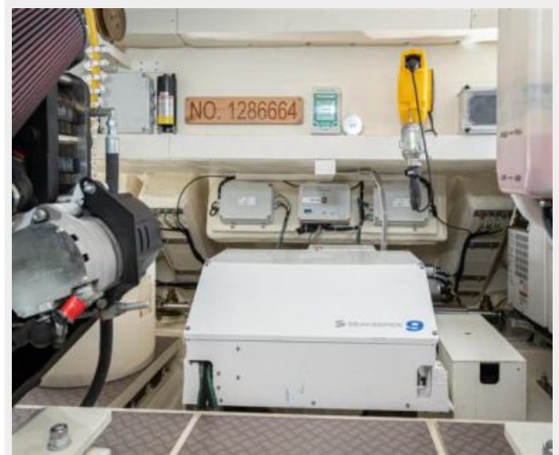
Seakeeper 9 Gyro Stabilizer