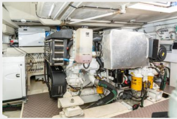
Engine Room - Port Engine