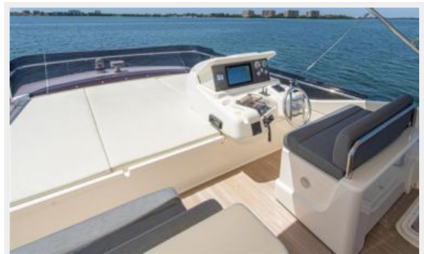
Flybridge Helm and Sun Pad