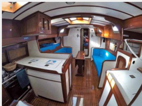
Galley to Salon