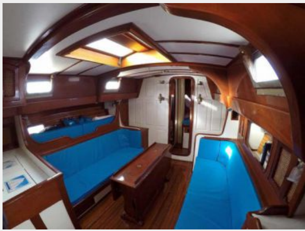
Salon, Looking Fwd.