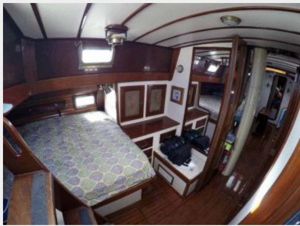
Aft Cabin, Looking Fwd.