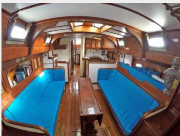
Salon, Looking Aft