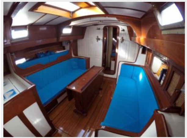
Salon, to Port