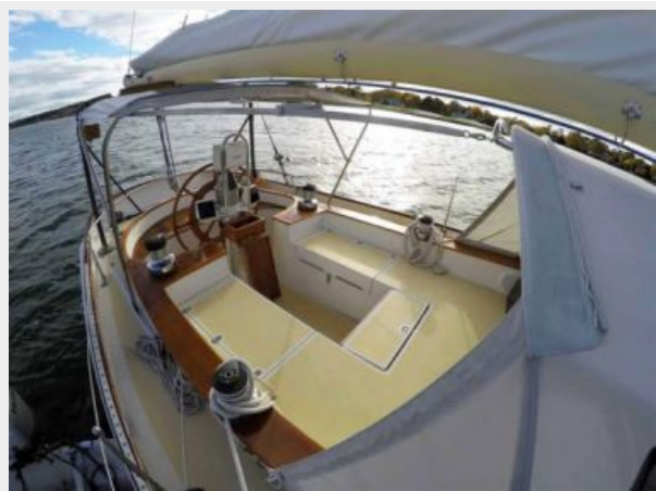
Cockpit Dodger and Bimini