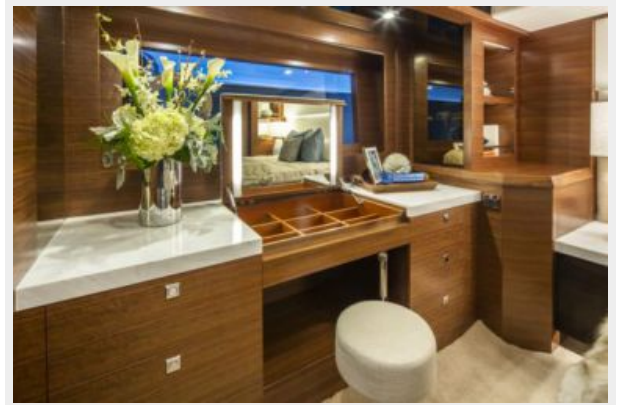
Horizon V68 27L