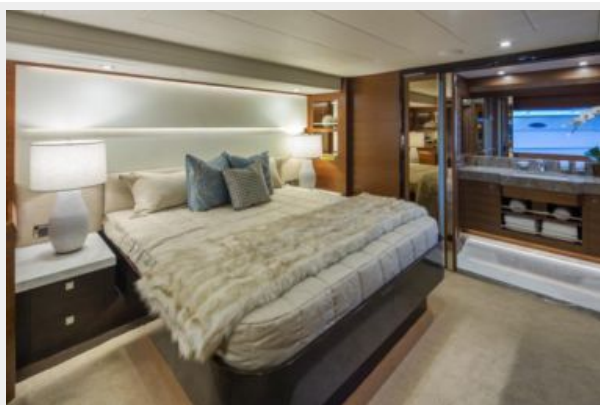
Horizon V68 29L