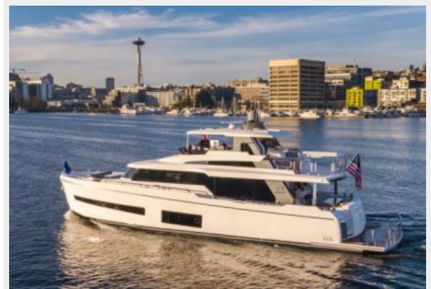
Horizon V68 06L