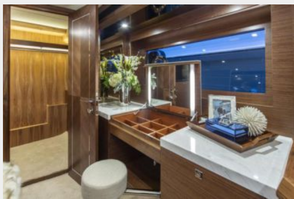
Horizon V68 28L