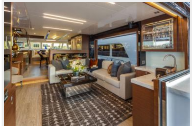
Horizon V68 34L