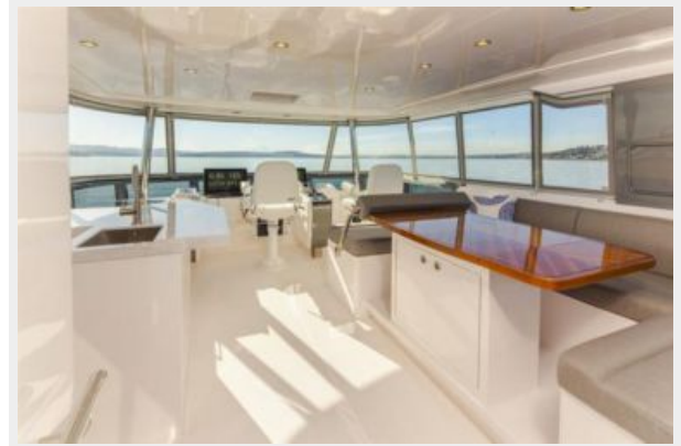
Horizon V68 New 53L