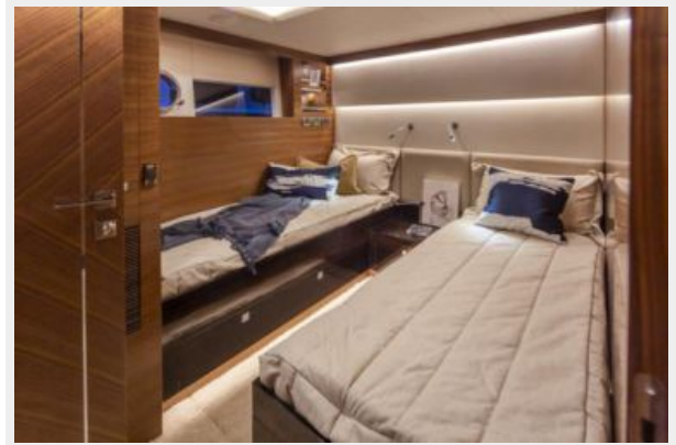
Horizon V68 49L