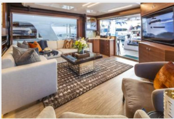
Horizon V68 36L