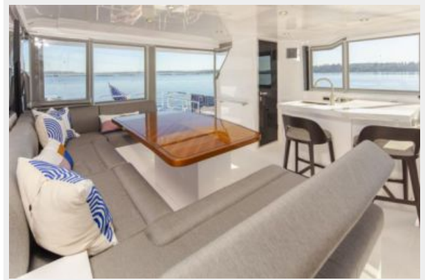
Horizon V68 New 62L