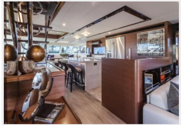
Horizon V68 10L