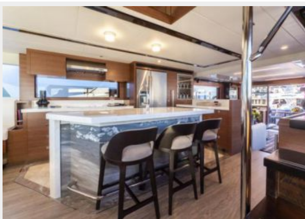
Horizon V68 11L