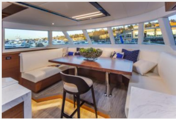
Horizon V68 39L