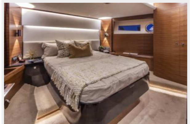
Horizon V68 58L