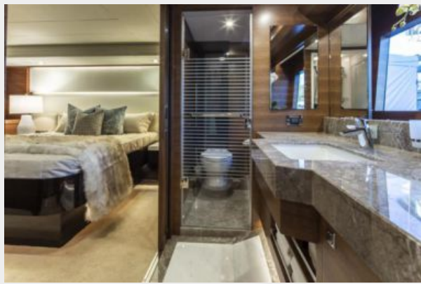
Horizon V68 24L