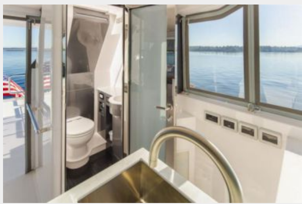
Horizon V68 New 63L