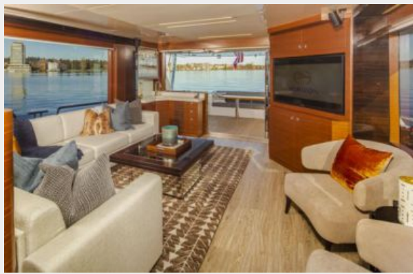
Horizon V68 New 43L