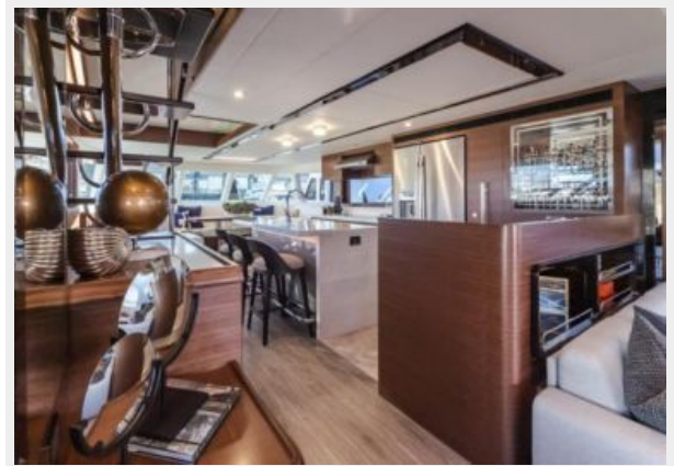
Horizon V68 10L