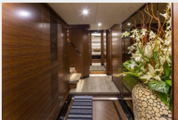
Horizon V68 47L