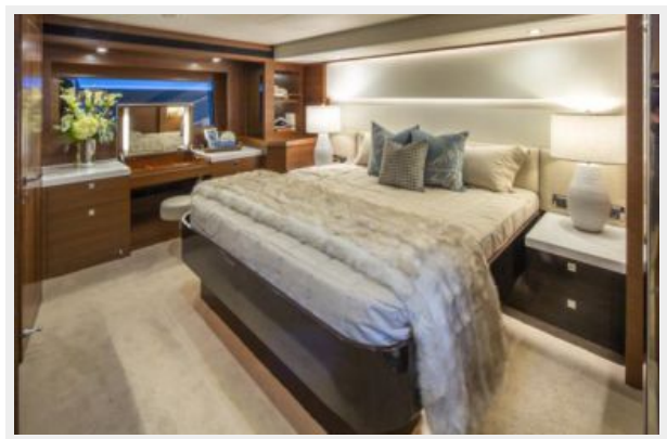
Horizon V68 26L