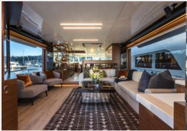
Horizon V68 09L