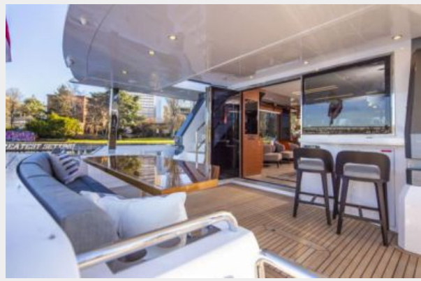
Horizon V68 New 29L