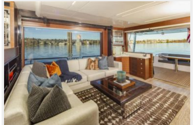
Horizon V68 New 42L