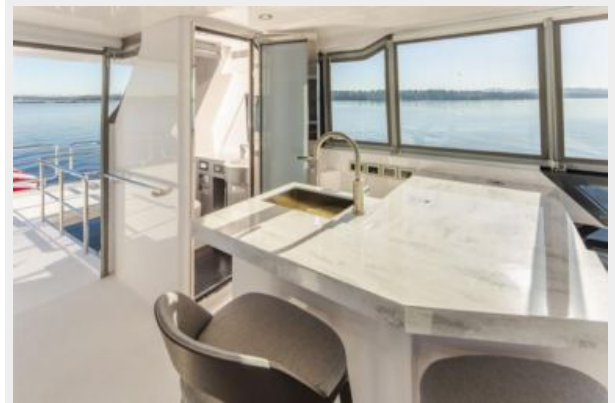
Horizon V68 New 64L