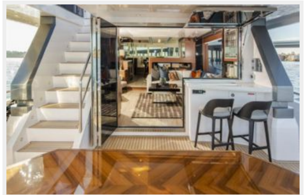
Horizon V68 New 36L