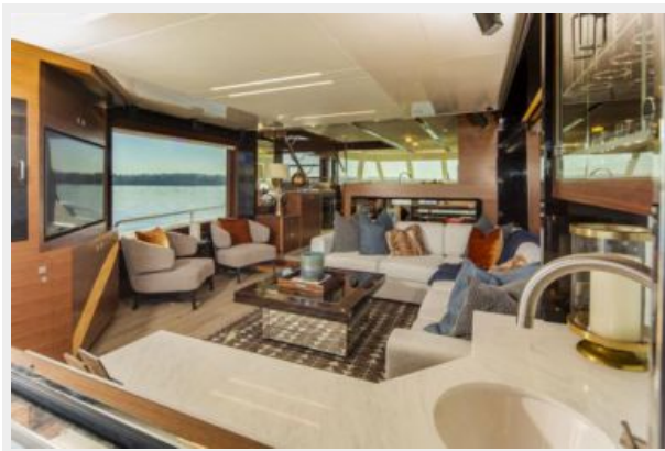
Horizon V68 New 40L