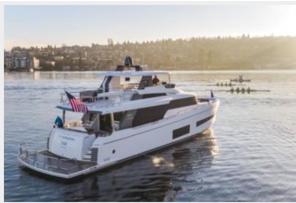
Horizon V68 04L