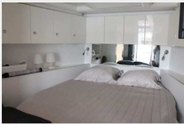
VanDutch55_2015_White Shark_Master Cabin