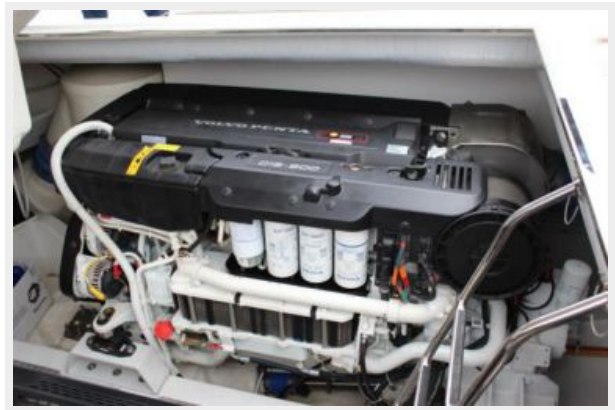
VanDutch55_2015_White Shark_Engine 1