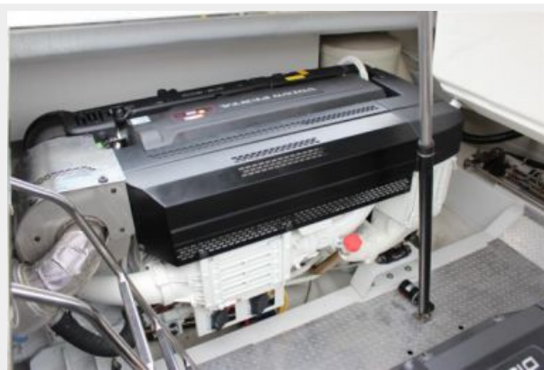
VanDutch55_2015_White Shark_Engine 2