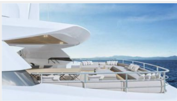
CONRAD C144S (10)