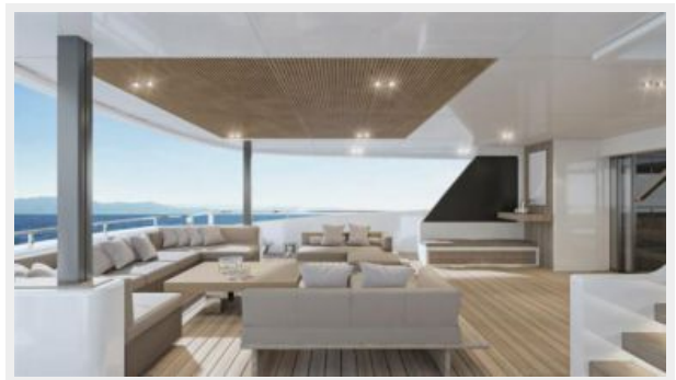
CONRAD C144S (4)