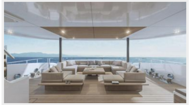
CONRAD C144S (2)