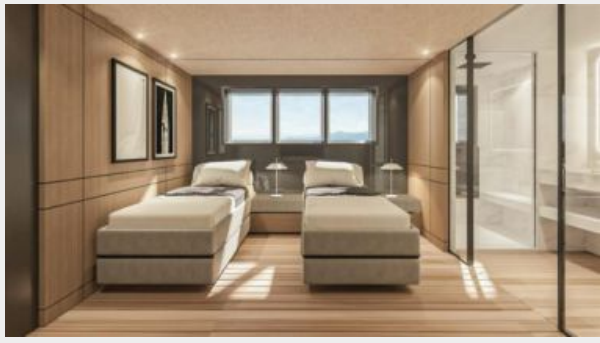
CONRAD C144S (14)