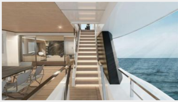
CONRAD C144S (1)