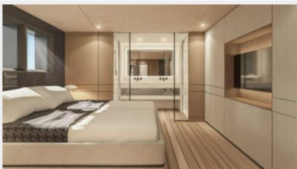
CONRAD C144S (17)