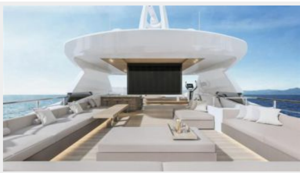
CONRAD C144S (6)