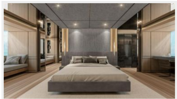
CONRAD C144S (24)