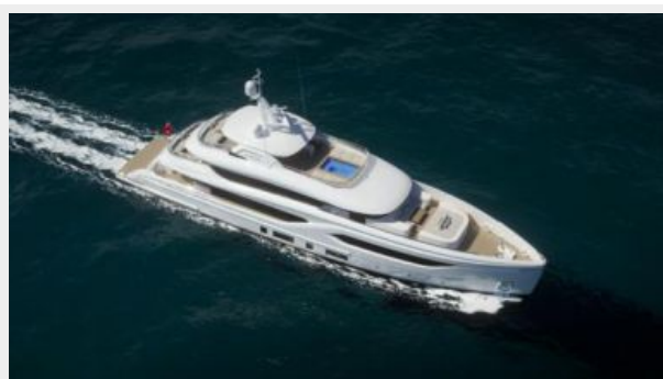
CONRAD C144S 1 (6)