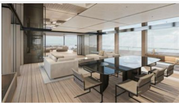
CONRAD C144S (21)