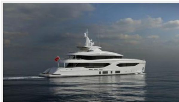
CONRAD C144S 1 (4)