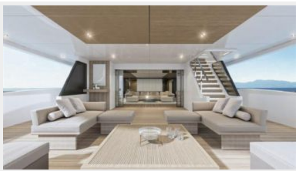
CONRAD C144S (3)