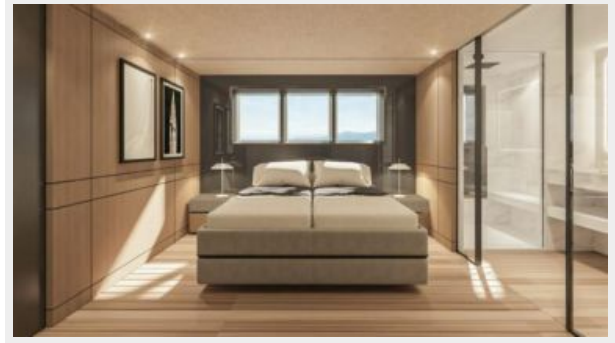
CONRAD C144S (15)