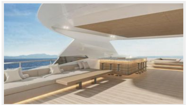
CONRAD C144S (8)