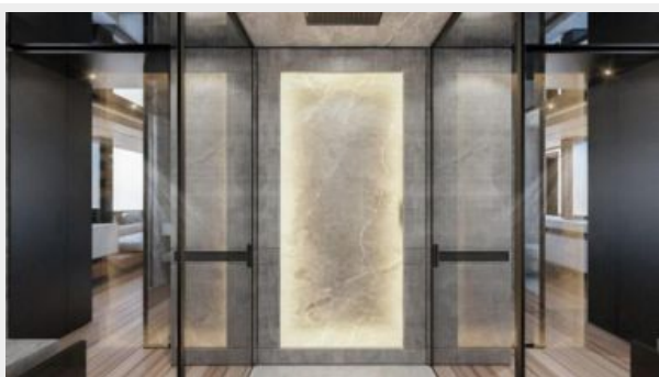
CONRAD C144S (27)