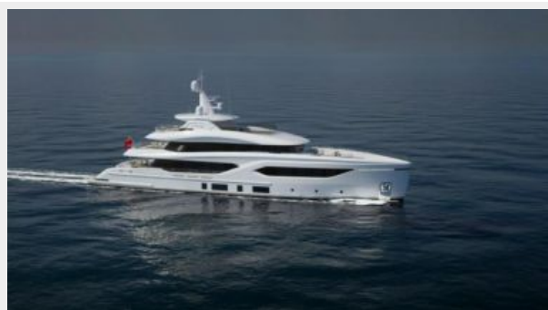
CONRAD C144S 1 (2)