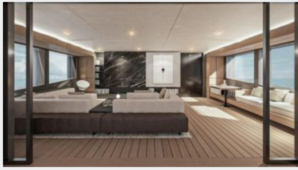
CONRAD C144S (33)