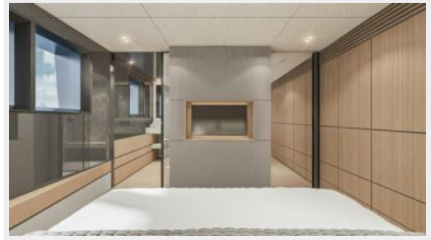
CONRAD C144S (36)