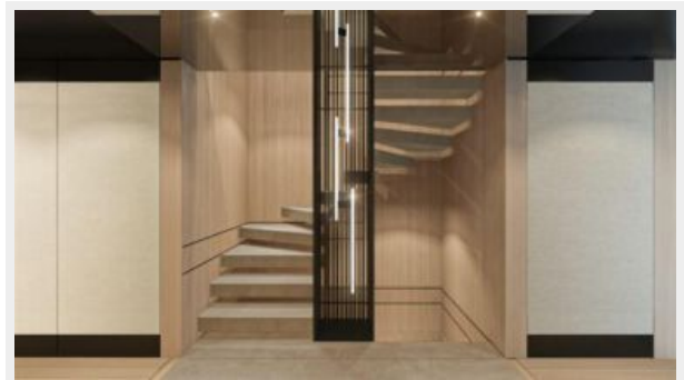
CONRAD C144S (19)