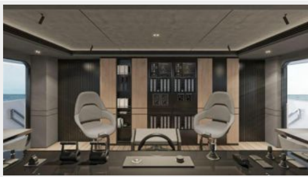
CONRAD C144S (41)