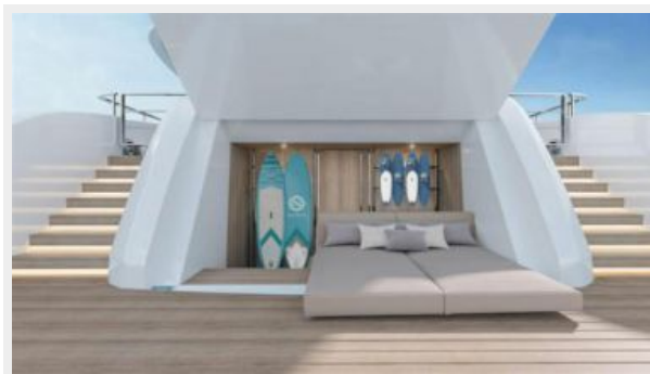
CONRAD C144S 2 (2)