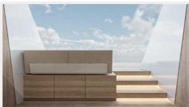
CONRAD C144S 2 (3)