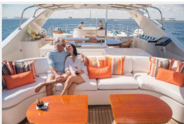
Sundeck Fwd Lounge 11_15_20_0490 (1)