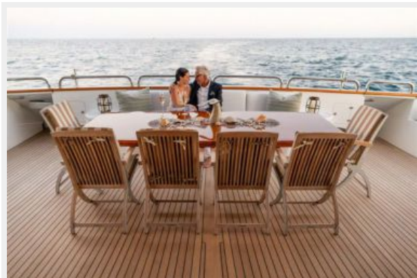
Aft Main Deck Dining 11_15_20_1048 (1)