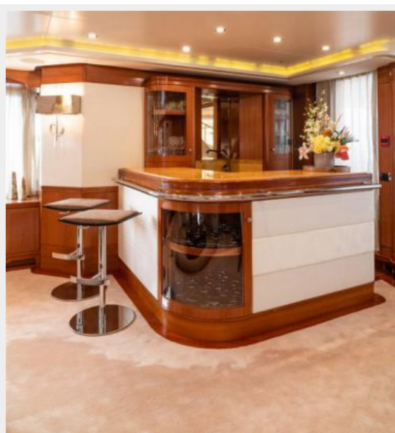
Main Salon Bar 11_14_20_0016 (1)