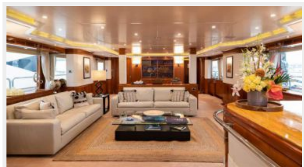
Main Salon 11_14_20_0009 (2)