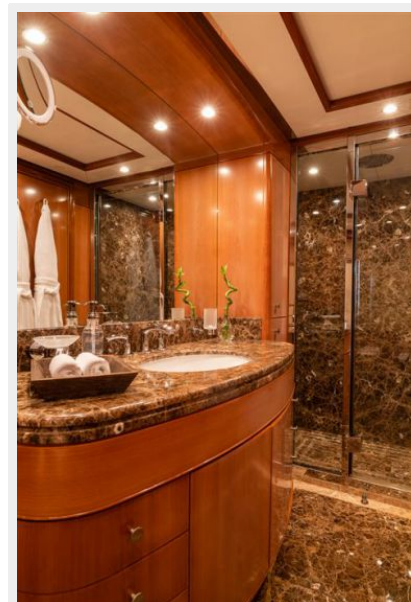
VIP Bath 11_14_20_0255 (1)