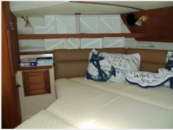
Forward Cabin Portside