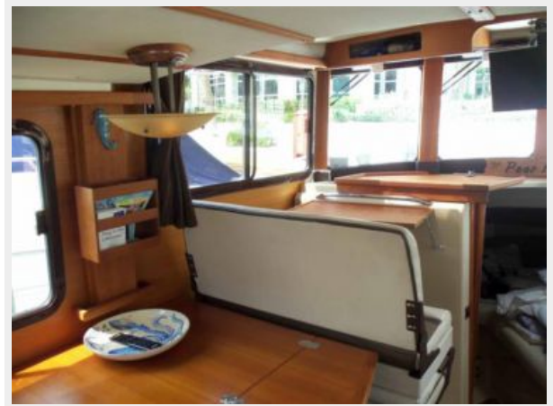
Dinette Converted to Companion Seat