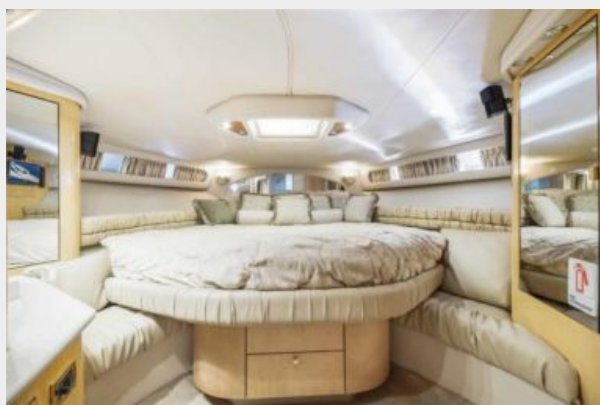
Master Looking Forward