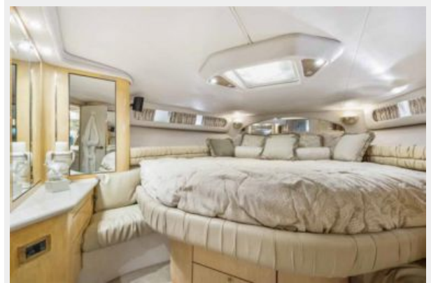
Master Looking to Port