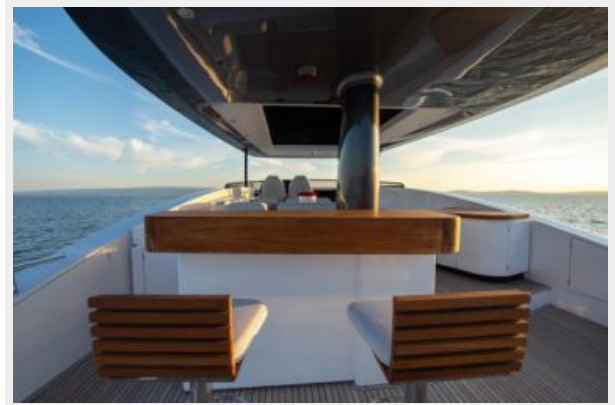
Bar on fly