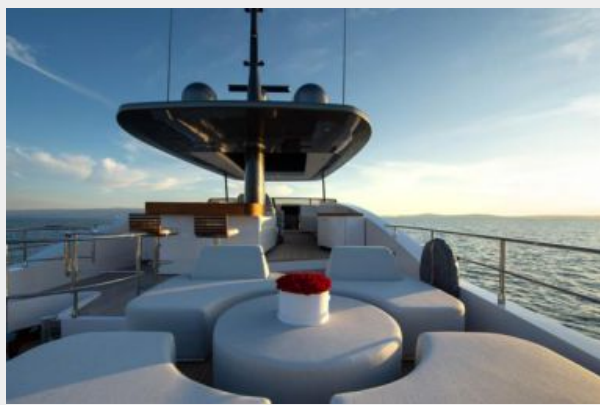
Lounge area on aft flybridge