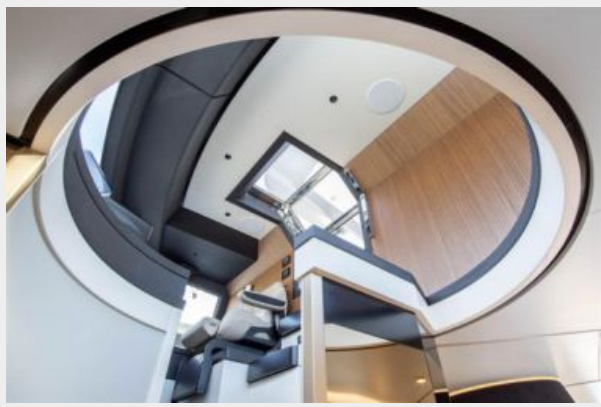
Stairs to main helm station