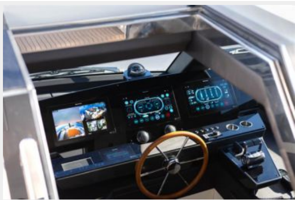
Main helm station