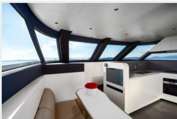
Seating area in galley