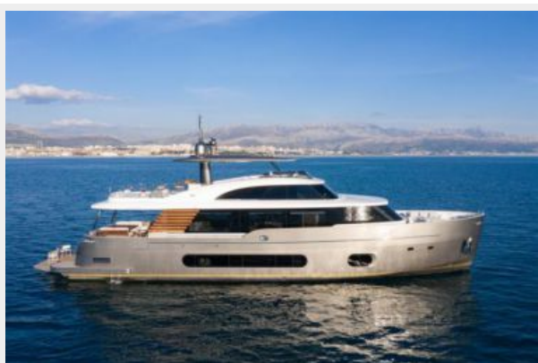
Exterior Magellano 25 METRI M/Y "OREL"