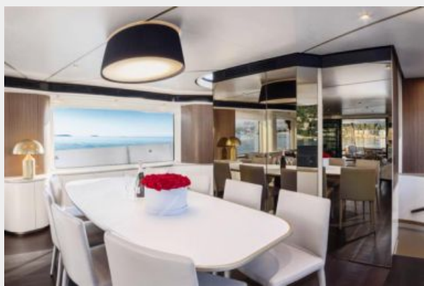
Dinette in salon