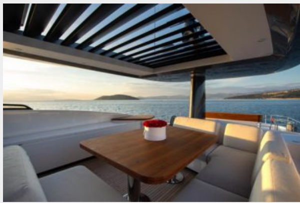
Dining area on fly