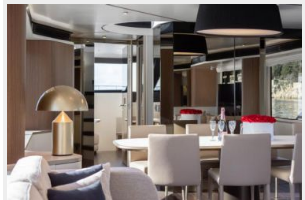
Access to galley