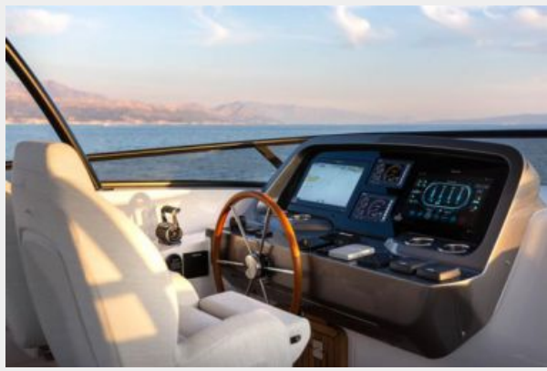
Helm station on flybridge