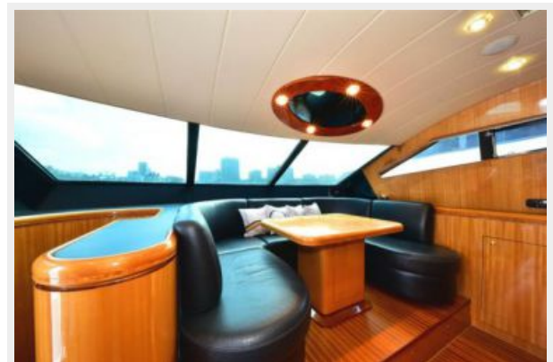
Galley Country Dinette with Lots of Extra Storage