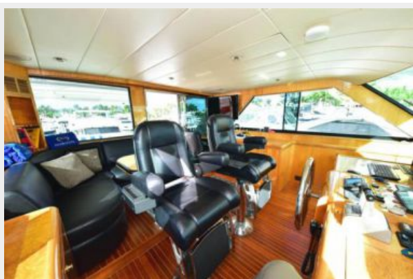
Helm Looking Aft with Desk, TV, Computer and Dining-Cruising-Relaxation-Lounge Area