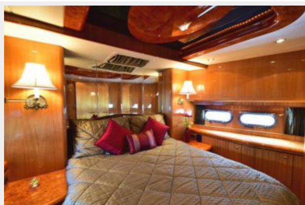
VIP Queen Forward