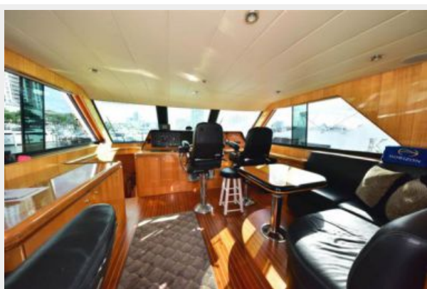
Skylounge-Helm with Dual Stidd Electric Helm Seats