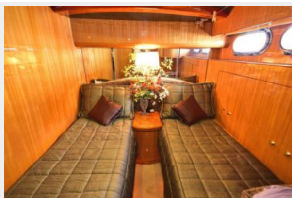
Guest Stateroom-Optional Crew Quarters Aft