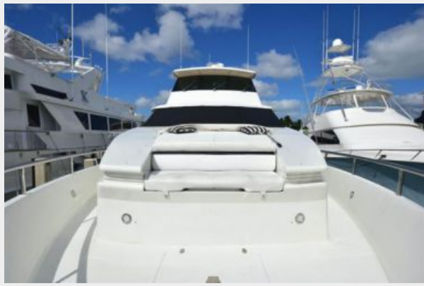
Foredeck with Bench Seating and Dual Custom Large Yacht Style Bosun's Lockers