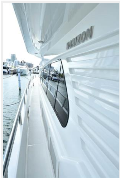
Beautiful Portside Walkaround with Almost New Looking Paint (Identical on STBD)