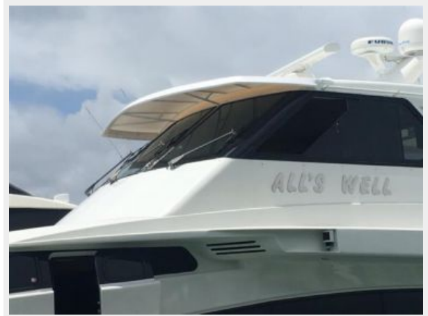
Enclosed Flybridge Port Front Side View