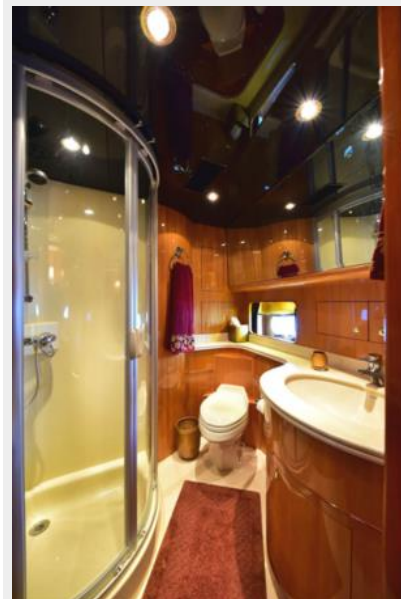
Guest Stateroom Full Head with Same Fit and Finish as Rest of Yacht