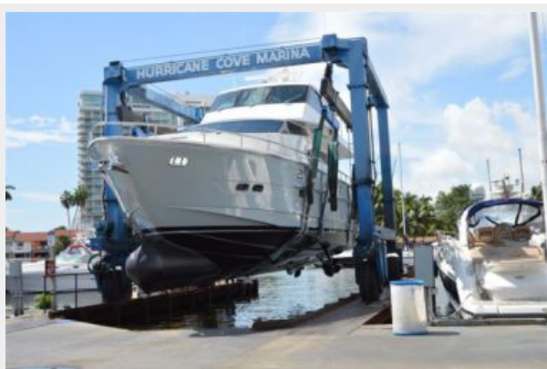
In Slings - Haulout