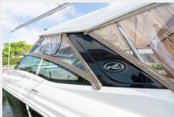
Cockpit and helm enclosures