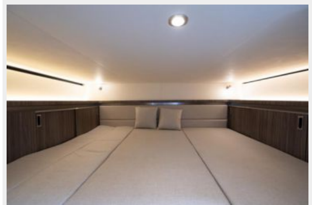
Mid-berth view 2