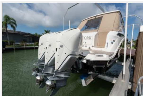
Triple engines view 2