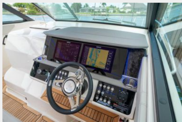
Helm dashboard view 2