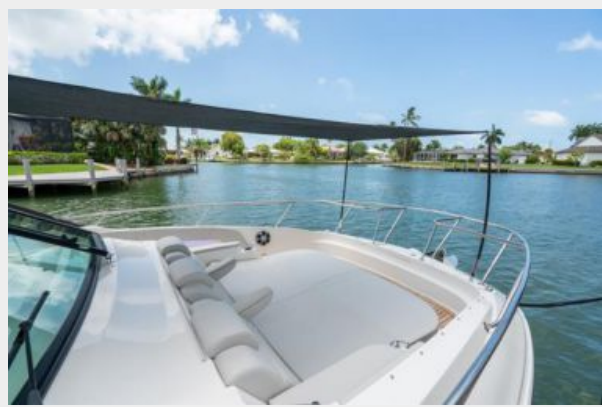
Bow seating with sunshade