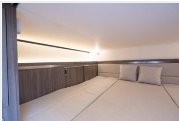
Storage in the mid-berth