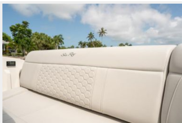
Aft bench seat