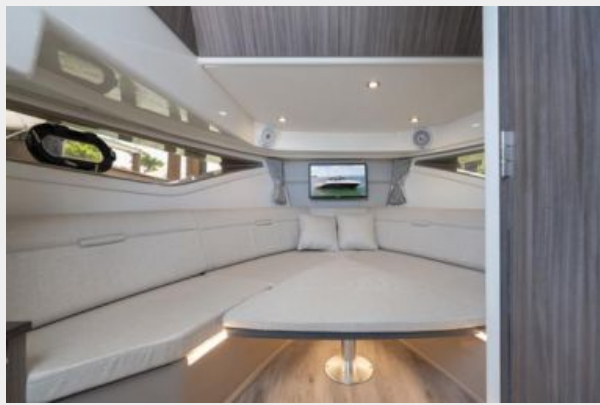
Salon view 2