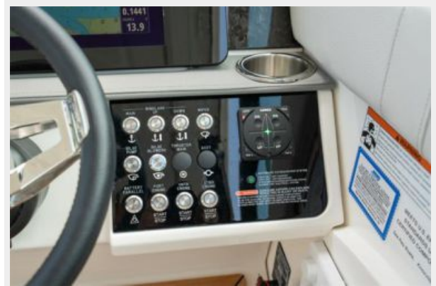
Helm controls/switch panel