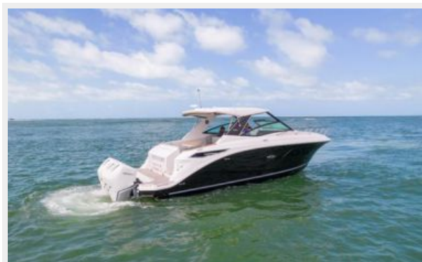
Stbd quarter profile