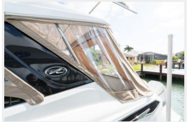
Cockpit enclosure view 2