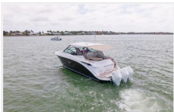
Port quarter profile 2