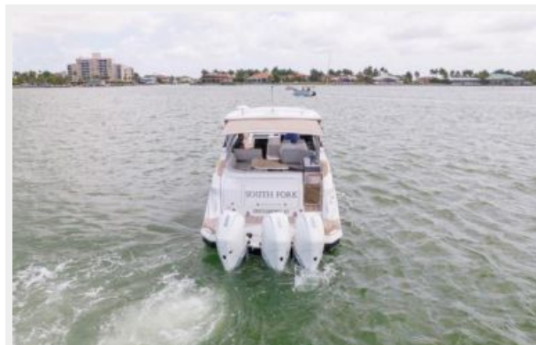
Stern profile 2