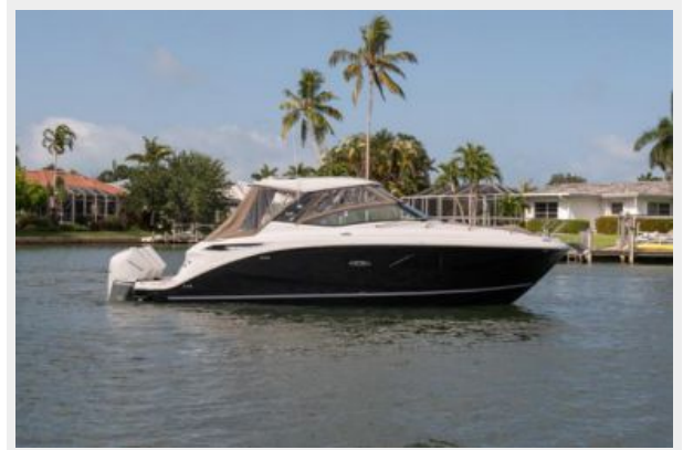
Stbd profile 2