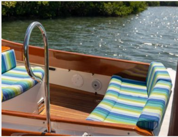
Bo-Peep stainless steel handrail