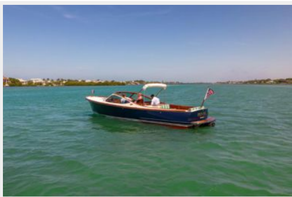
Port quarter profile