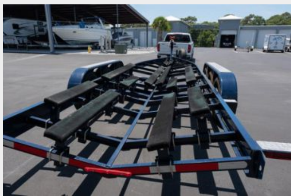
Loadmaster trailer view 5