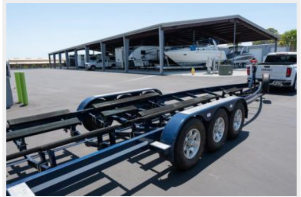
Loadmaster trailer view 4