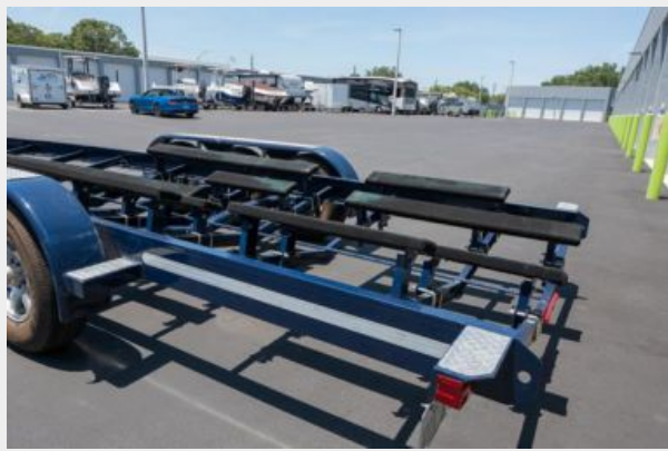
Loadmaster trailer view 3