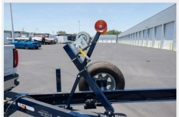
Loadmaster trailer view 6