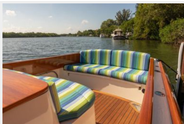
Aft cockpit settee