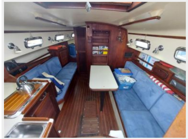
031Slainte Salon Table