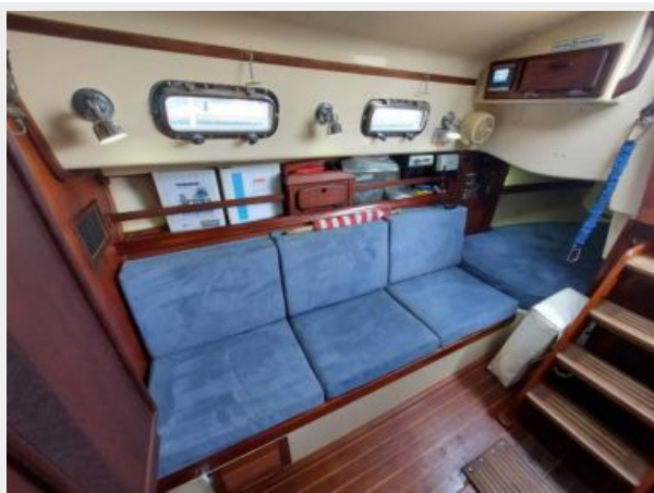
034Slainte Salon Port