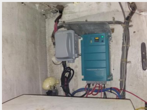
020Slainte Battery Charger