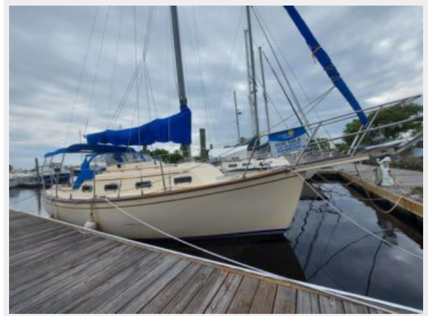
002Sainte Starboard Bow