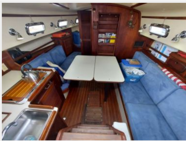
032Slainte Salon Table Full