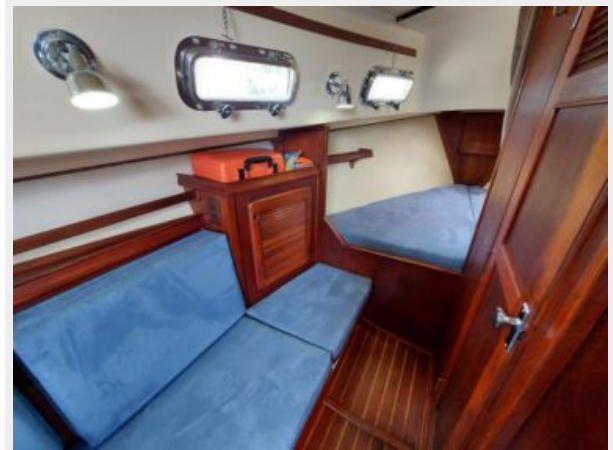
060Slainte Salon Looking Forward