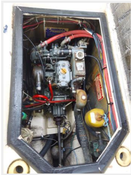
025Slainte Engine Compartment