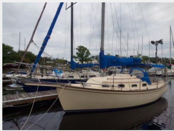
001Slainte Port Bow