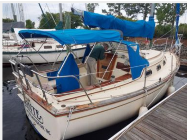
003Slainte Starboard Stern