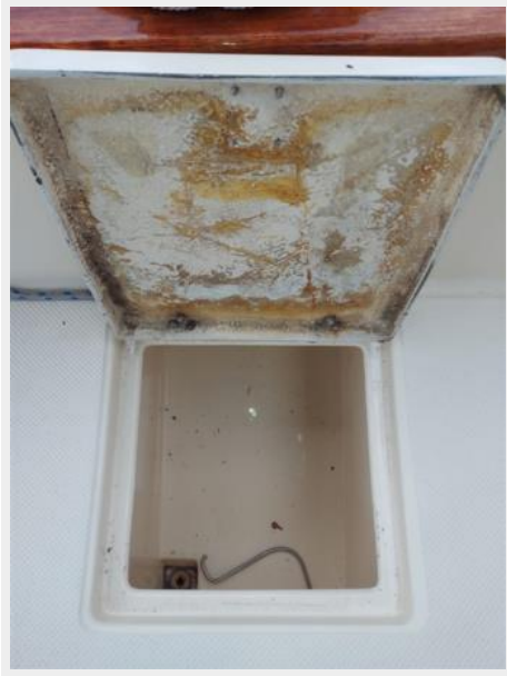
022Slainte Cockpit Cooler