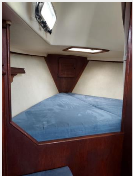
061Slainte V Berth