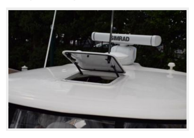
Hardtop hatch open, Simrad radar scanner