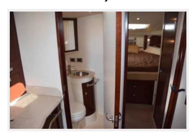
Forward view with head door open, Master entry