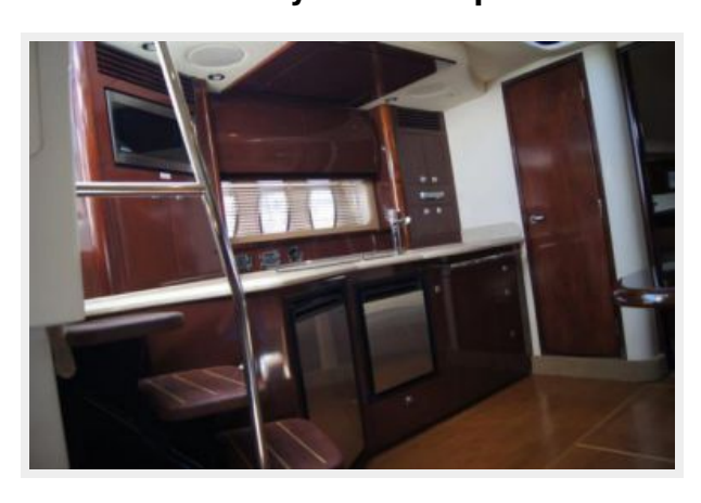
Galley with TV up