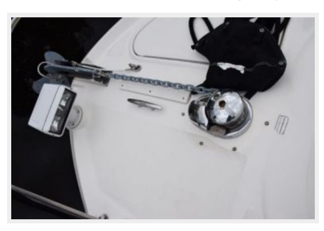
Windlass, Anchor chute, Spotlight