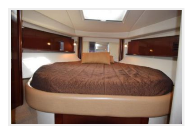
Master double berth