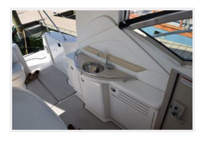
Port side wet bar