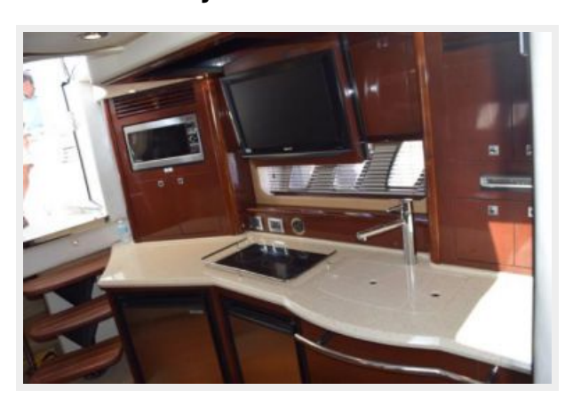
Galley with TV lowered