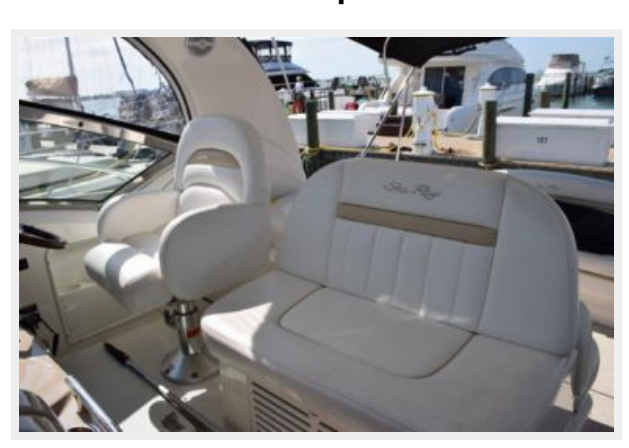
Helm and Companion Seat