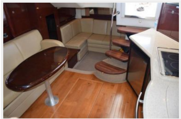
Wood Cabin Sole