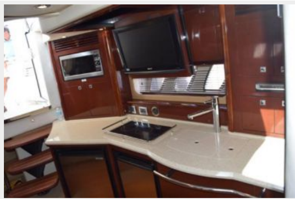
Galley with TV lowered