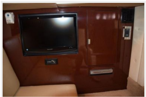
Aft Cabin TV and DVD player