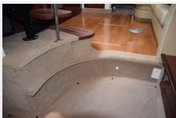
Canvas Carpet Runner