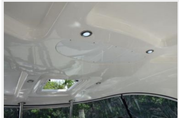
Underside of Hardtop