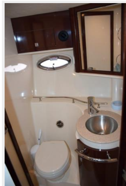
Head with sink vanity