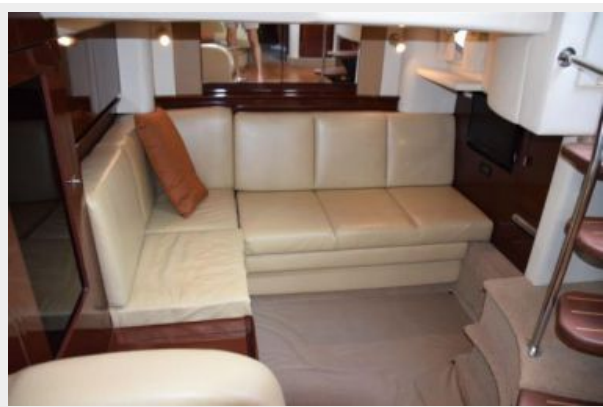
Aft Cabin Settee