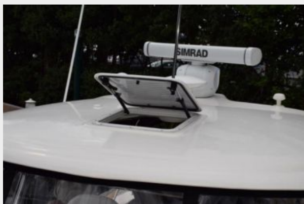
Hardtop hatch open, Simrad radar scanner