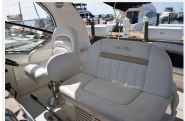
Helm and Companion Seat