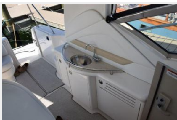
Port side wet bar