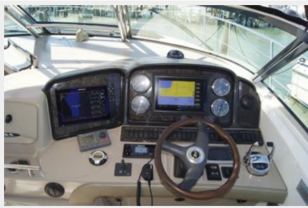
Helm with updated Simrad and Garmin MFD'S