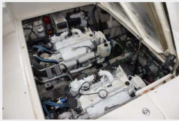
Cummins QSB 5.9 diesels 425hp each