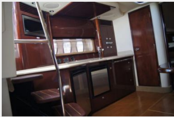
Galley with TV up