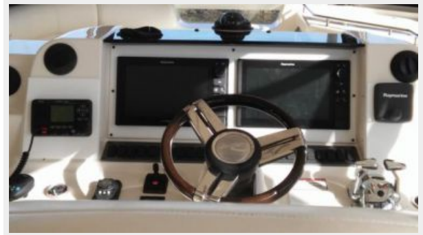
7_2005 58ft Sea Ray 550 Sedan Bridge FIRST LIGHT