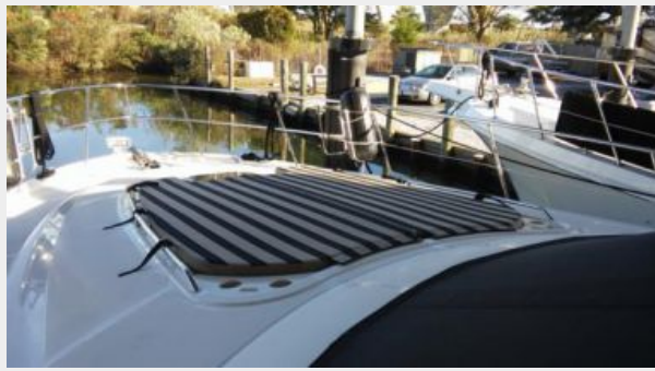
2_2005 58ft Sea Ray 550 Sedan Bridge FIRST LIGHT