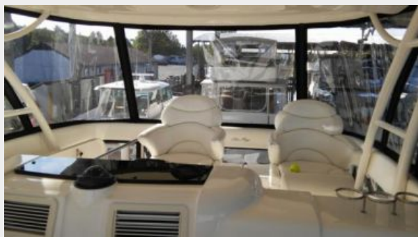
4_2005 58ft Sea Ray 550 Sedan Bridge FIRST LIGHT