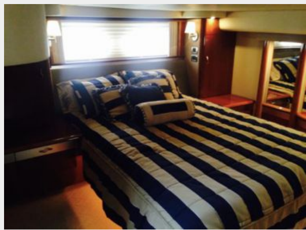
18_2005 58ft Sea Ray 550 Sedan Bridge FIRST LIGHT