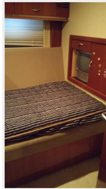
21_2005 58ft Sea Ray 550 Sedan Bridge FIRST LIGHT