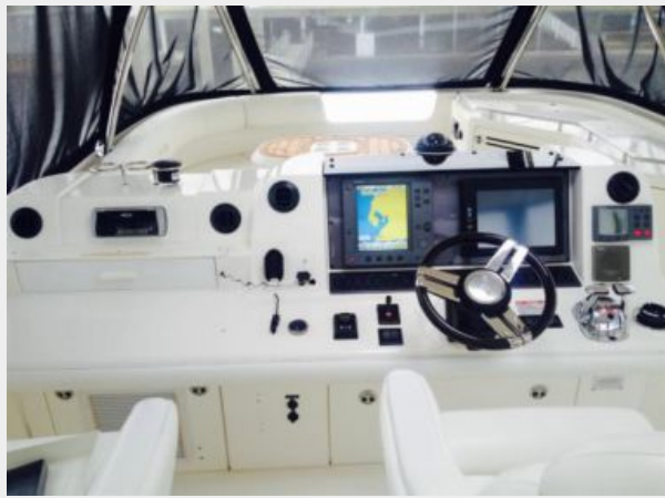
6_2005 58ft Sea Ray 550 Sedan Bridge FIRST LIGHT