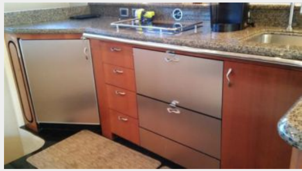
16_2005 58ft Sea Ray 550 Sedan Bridge FIRST LIGHT