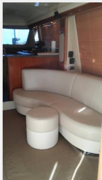
14_2005 58ft Sea Ray 550 Sedan Bridge FIRST LIGHT