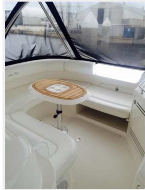
3_2005 58ft Sea Ray 550 Sedan Bridge FIRST LIGHT