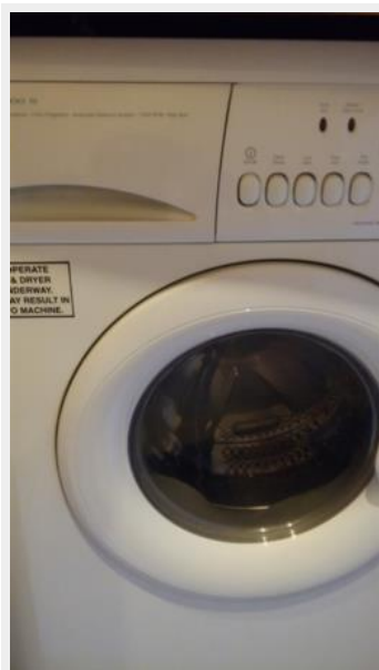
22_2005 58ft Sea Ray 550 Sedan Bridge FIRST LIGHT