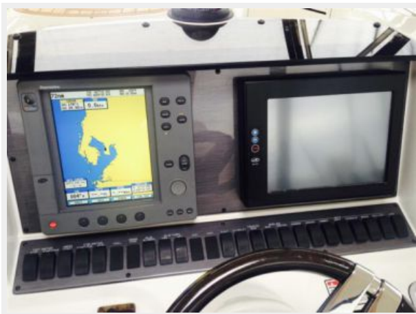
8_2005 58ft Sea Ray 550 Sedan Bridge FIRST LIGHT