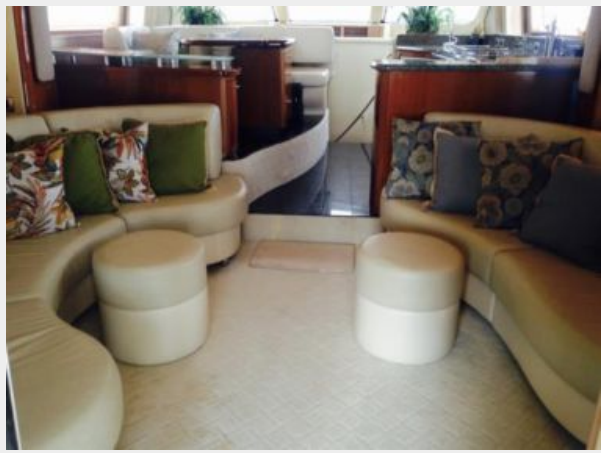
12_2005 58ft Sea Ray 550 Sedan Bridge FIRST LIGHT