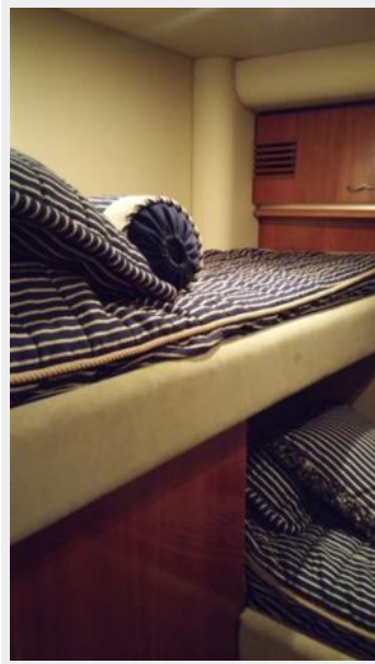
20_2005 58ft Sea Ray 550 Sedan Bridge FIRST LIGHT