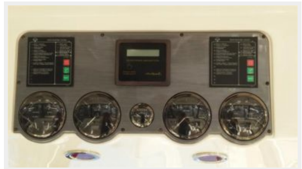
9_2005 58ft Sea Ray 550 Sedan Bridge FIRST LIGHT