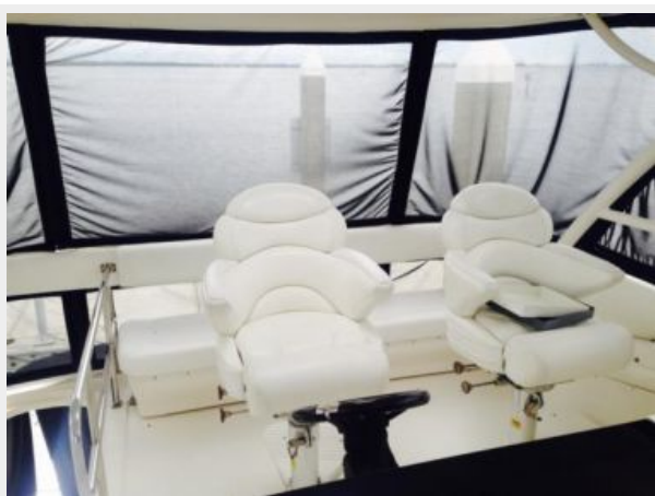
10_2005 58ft Sea Ray 550 Sedan Bridge FIRST LIGHT