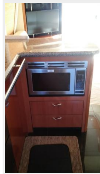
17_2005 58ft Sea Ray 550 Sedan Bridge FIRST LIGHT