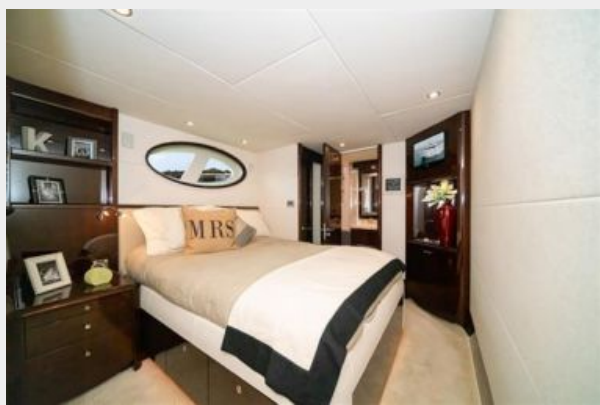
Starboard VIP Stateroom