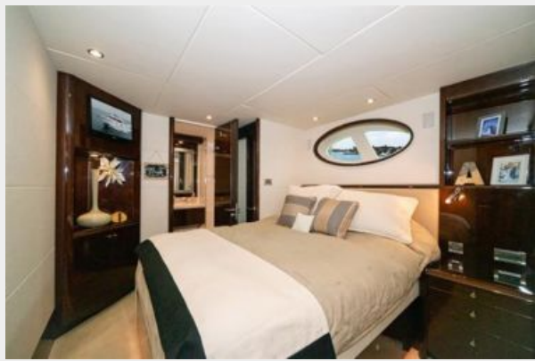
Port VIP Stateroom