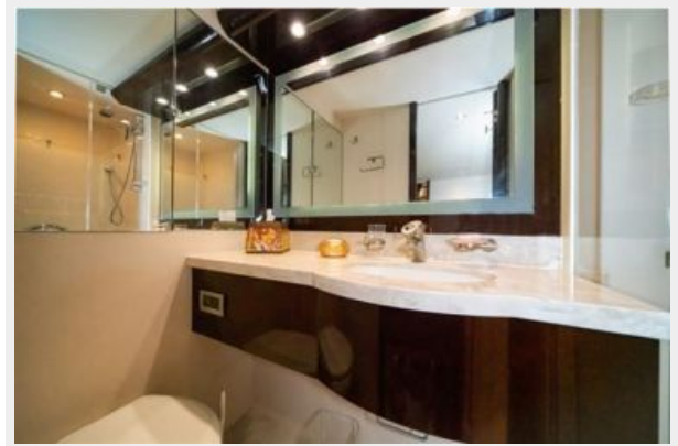
Port VIP Bath