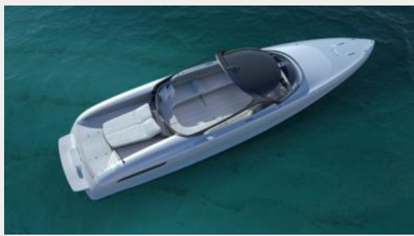
WhatsApp Image 2021-05-10 at 11.11.43