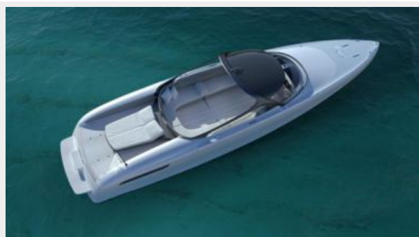
WhatsApp Image 2021-05-10 at 11.11.43